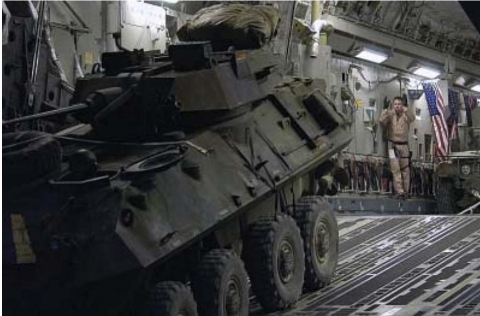
Enduring Freedom. Off-loading a US Marine light armored vehicle, Pasni, Pakistan, November 2001.