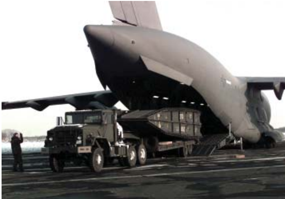
Taszar Airfield, Hungary. When flooding along the Sava River threatened to delay the US Army's movement into Bosnia, C-17s aided efforts by transporting pontoon bridge sections, December 1995.