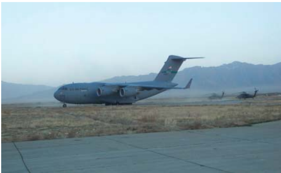
C-17 taxis down the runway during Operation Anaconda, March 2002.