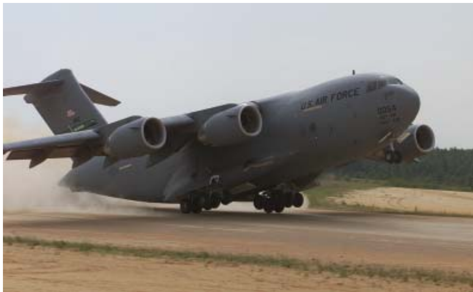
McChord 62d Airlift Wing crew makes an assault dirt strip landing during Rodeo 2000.