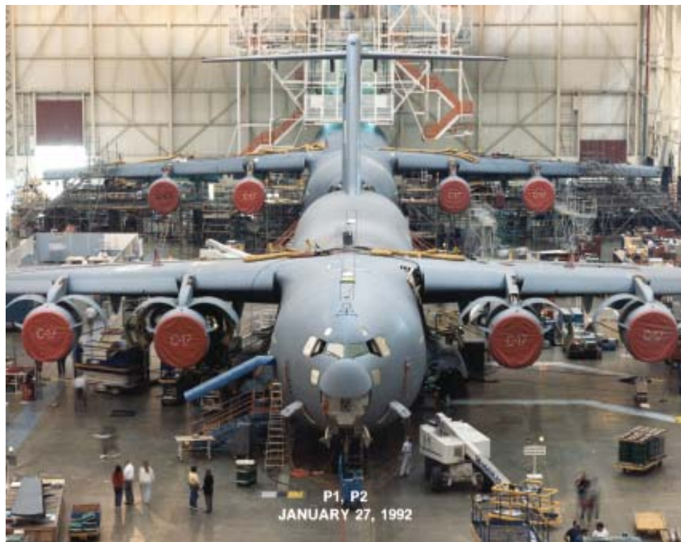
P-1 and P-2, January 1992. (Boeing)