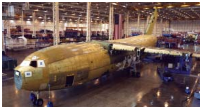
T-1 out of the major join tool and moving under its own landing gear, July 1990.