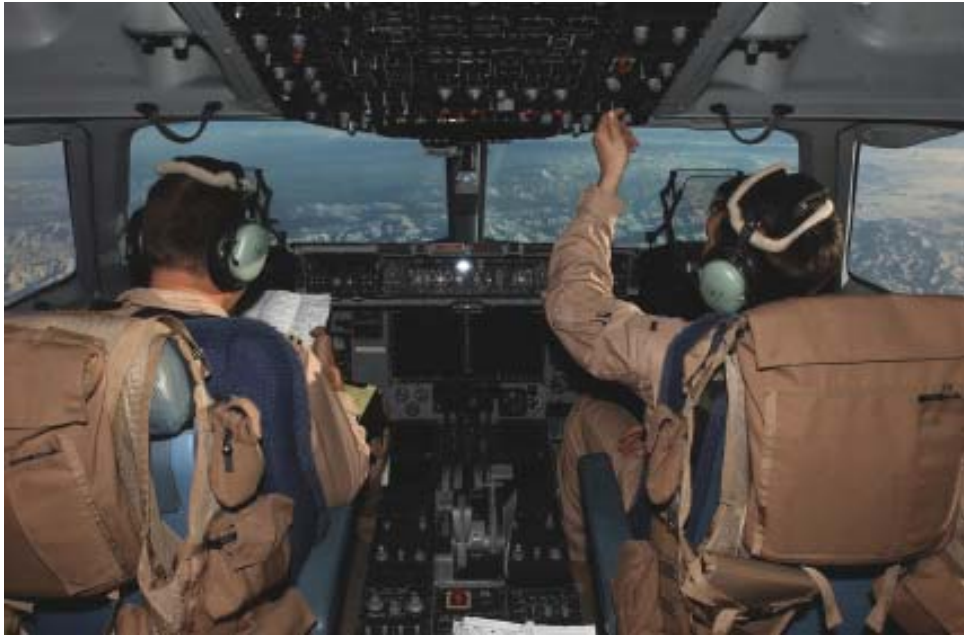
A Charleston crew on a mission from Bagram to Kandahar International Airport, Afghanistan, February 2002.