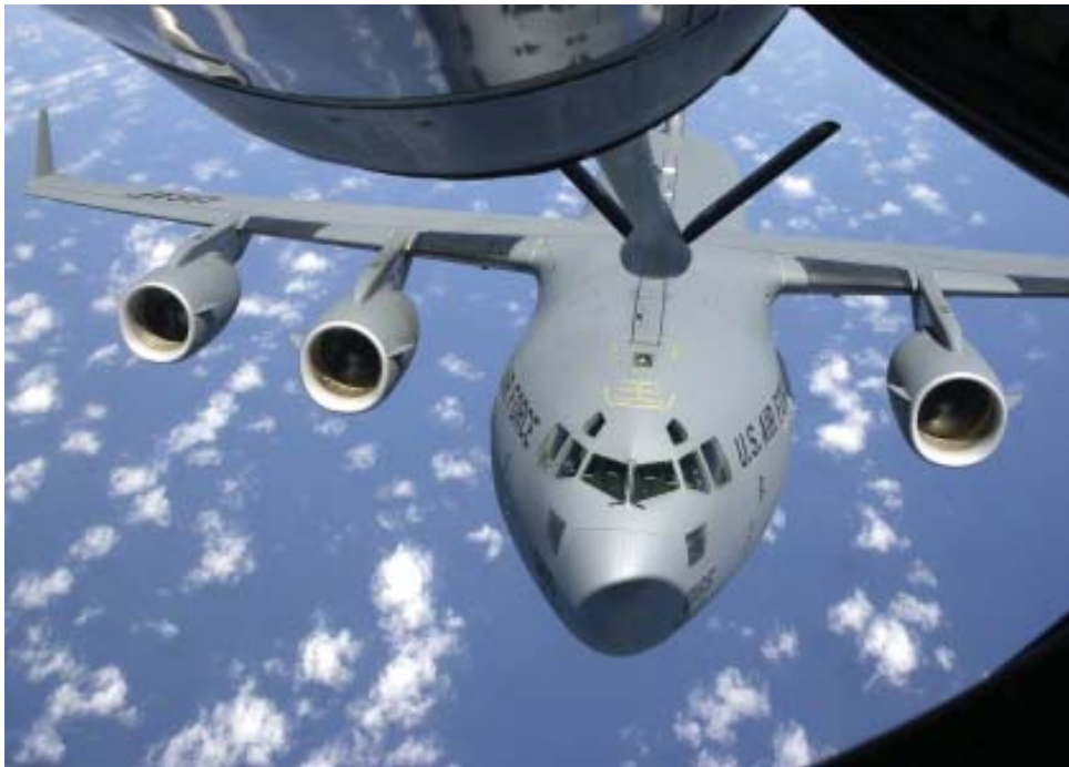
Air refueling from an Air National Guard KC-135 over the South China Sea in support of India earthquake relief, February 2001.