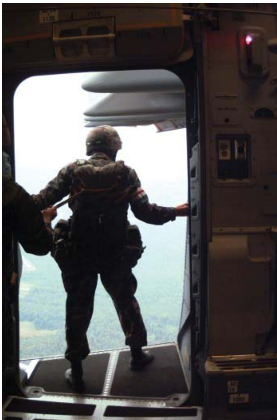
CENTRAZBAT '97. A paratrooper from the 82d Airborne Division executes a jump from the C-17, September 1997.