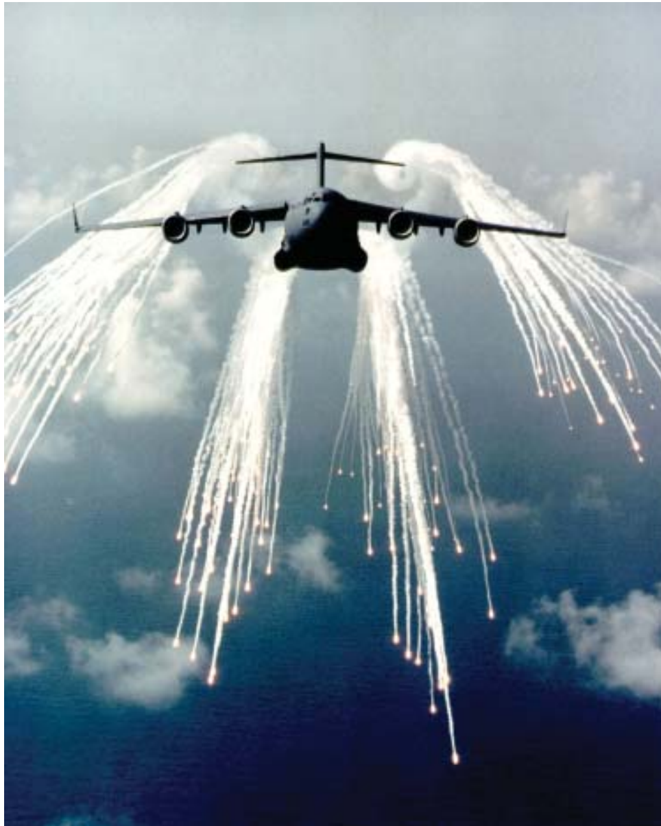
C-17 displaying anti-missile flares during a test, Eglin Air Force Base, Florida, 1994.