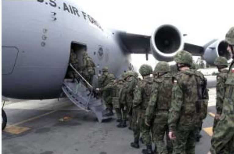
Ramstein Air Base, Germany. Polish peacekeeping soldiers bound for Kosovo, April 2000.