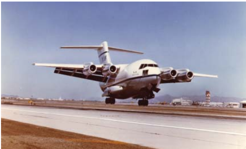
McDonnell Douglas' YC-15 performing a test flight.