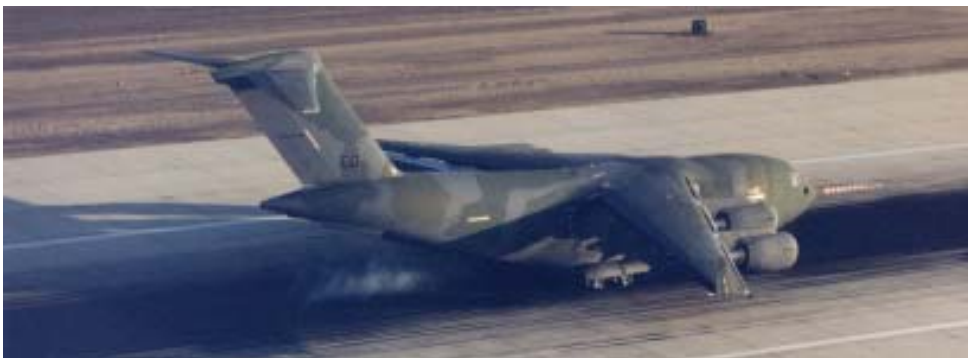
T-1 landing at Edwards Air Force Base, California, after making the first C-17 flight, 15 September 1991. (Boeing)