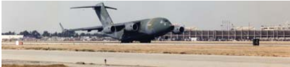
T-1 high speed taxi with nose rotation, 12 September 1991.