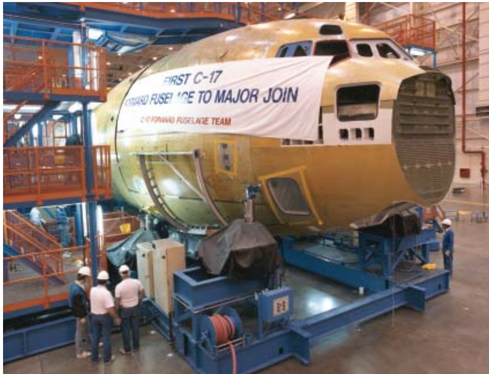
Forward fuselage to major join, February 1990.