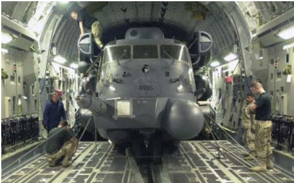
Offloading a special operations MH-53J Pave Low helicopter in support of Enduring Freedom, December 2001. (USAF, TSgt Scott Reed).