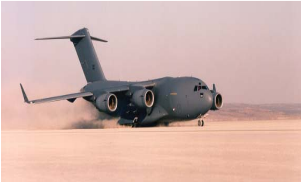
P-3 landing on dry lakebed, September 1992.