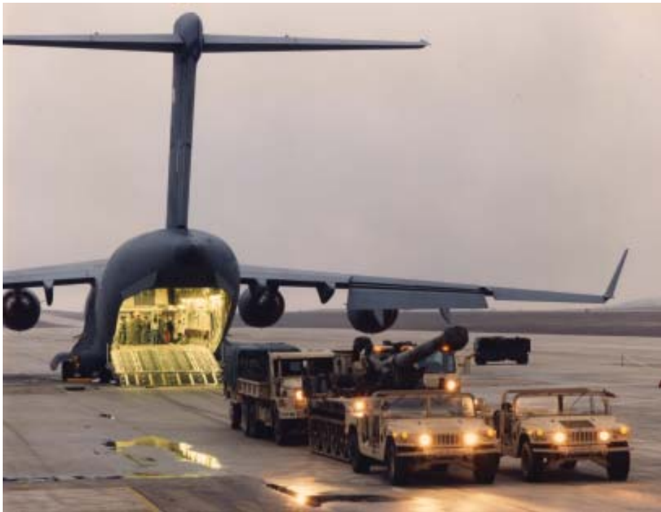
Loading the C-17 with two HUMVEES, a M1102A self-propelled howitzer (62,500 pounds), a 2.5-ton truck with trailer, and a 10-ton Oshkosh truck, Fort Hood, Texas, February 1993.