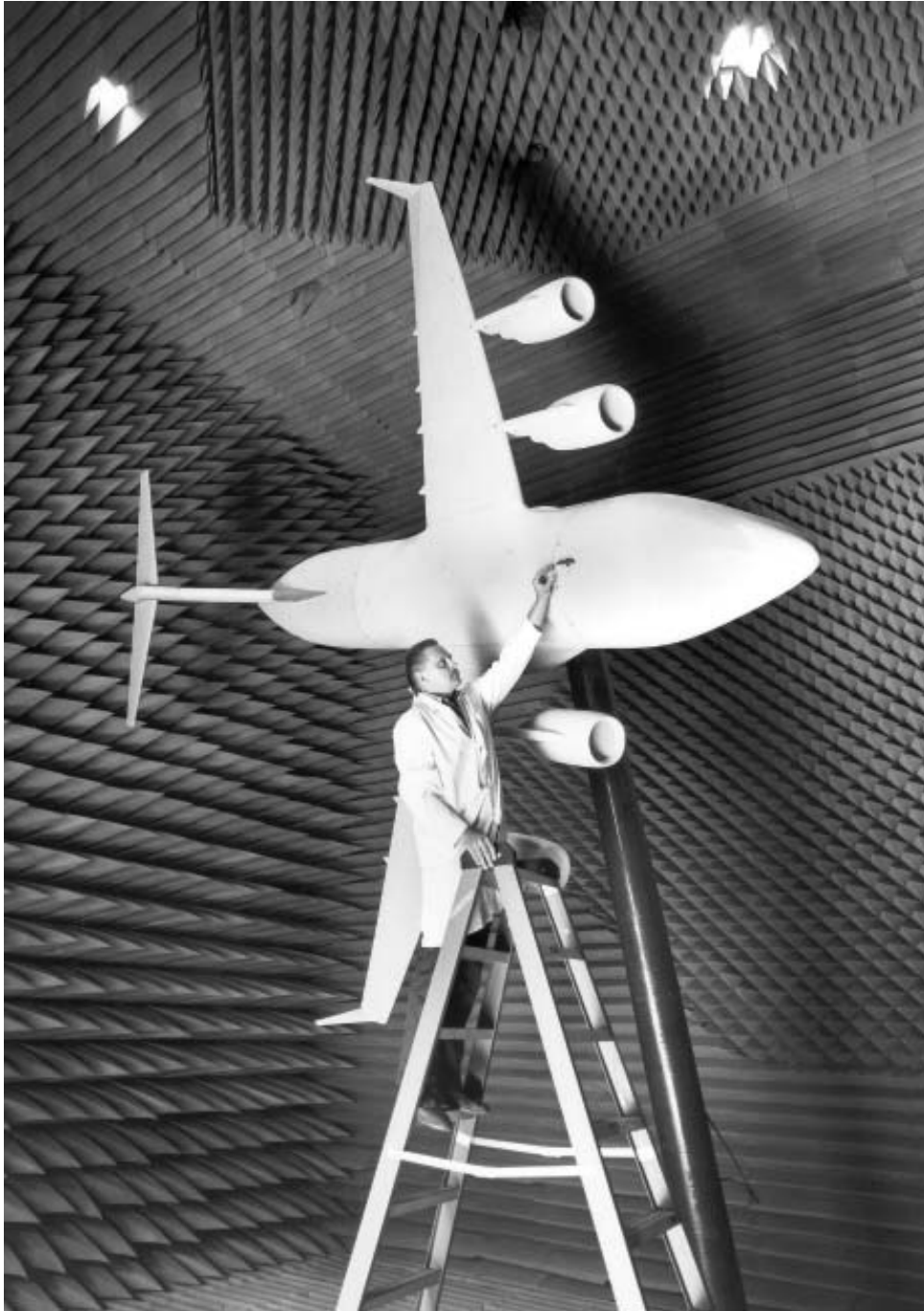
One-tenth scale model.