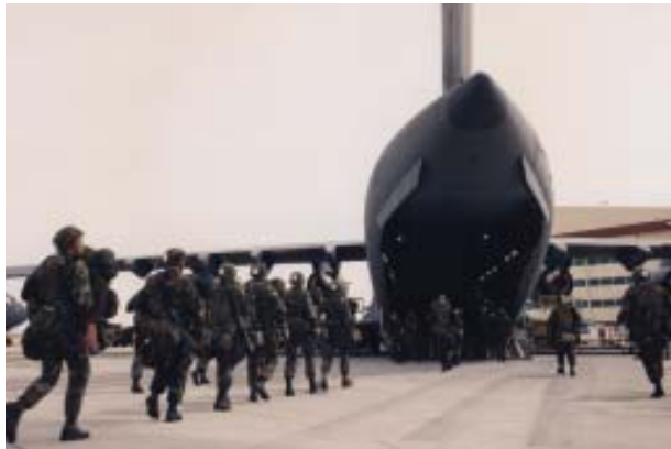
Marines participating in emergency egress tests, Edwards Air Force Base.