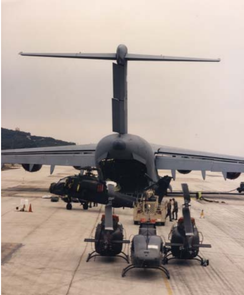
Preparing to load AH-64 Apache and OH-58C Kiowa helicopters, Fort Hood, Texas, February 1993.