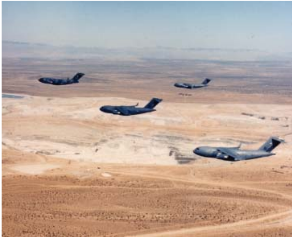
Four-ship formation, one-year anniversary, 15 September 1992.