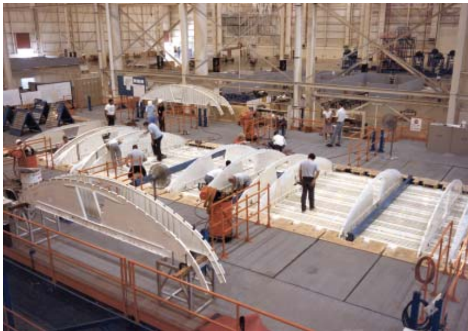
Attaching underfloor bulkheads.