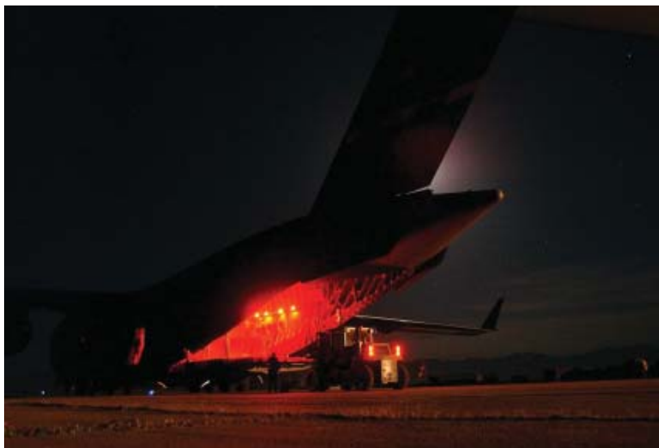
Nighttime upload of cargo, Afghanistan, April 2002.