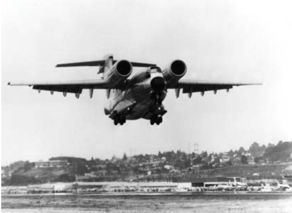
Boeing's YC-14 taking off on its maiden flight, August 1976.