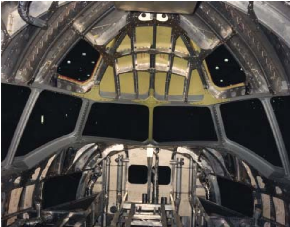
Interior of cockpit, 1988.