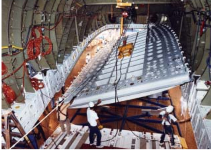
Installing T-1's cargo door.