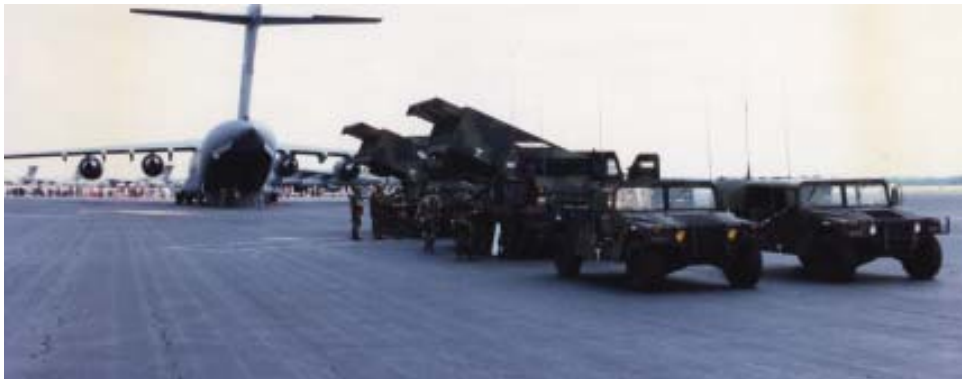
First operational unit delivery. P-6 (89-1192) unloads an 110,000-pound payload upon arriving at Charleston Air Force Base, 14 June 1993.