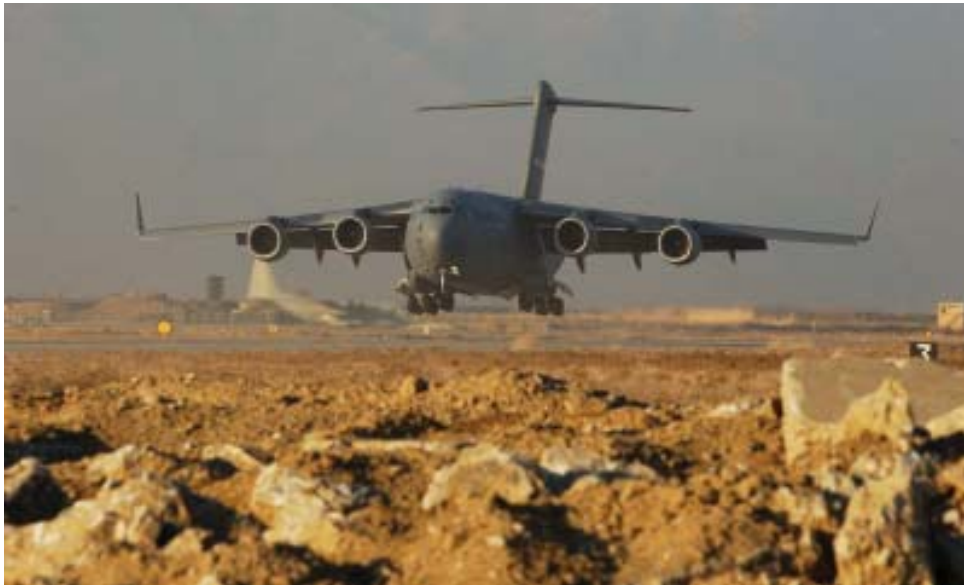
Touchdown at Bagram Airfield, Afghanistan, February 2004.