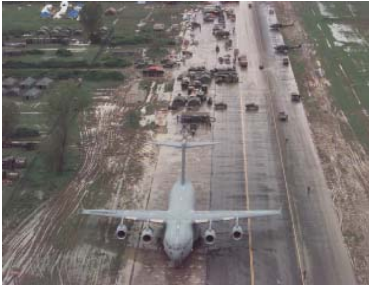
Allied Force. The C-17 proved adept at flying in and out of the austere and congested Rinas Airport, Tirana, Albania.