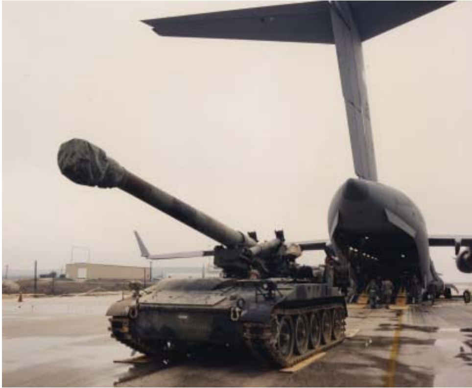
Disgorging the outsized M1102A self-propelled howitzer, Fort Hood, Texas.