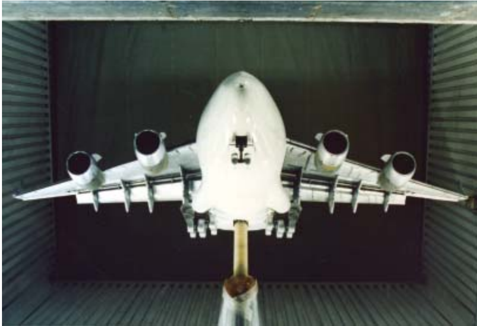
Wind tunnel testing.