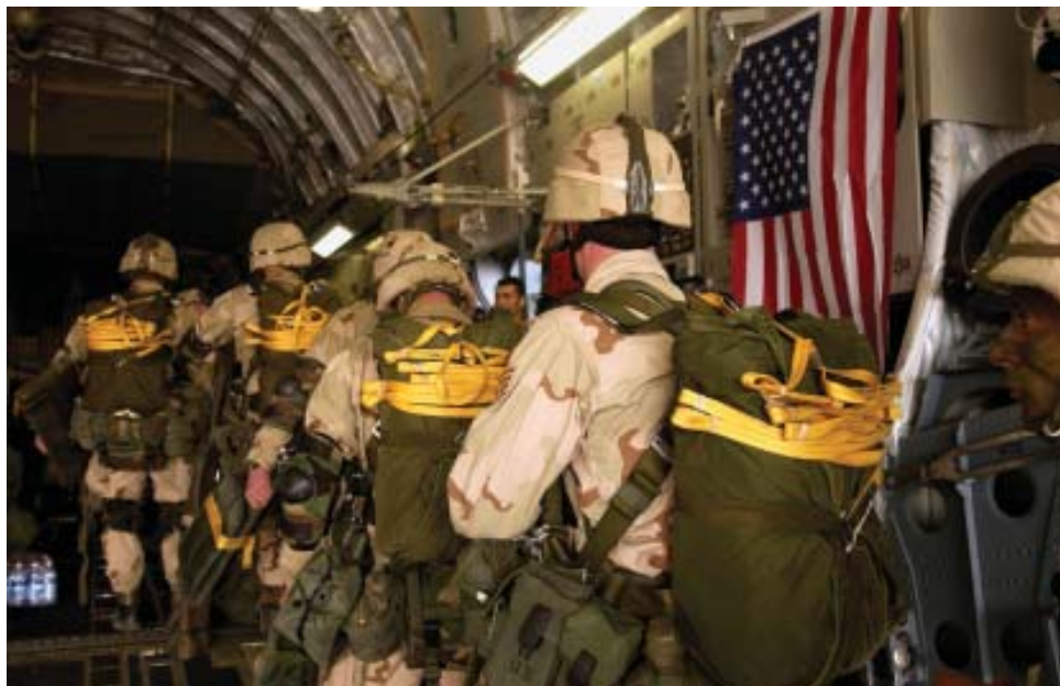
Iraqi Freedom. US Army paratroopers and Air Force tactical air controllers from the 173d Airborne Brigade preparing to move forward into northern Iraq, 26 March 2003.