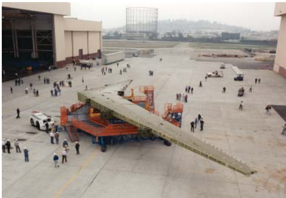
Wings to major join move, March 1990. (Boeing)