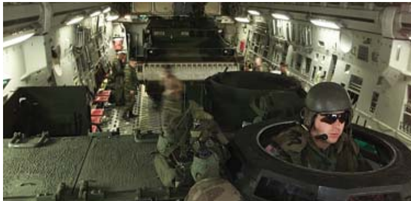
Task Force Hawk. Final approach into Tirana. Getting ready to drive off.