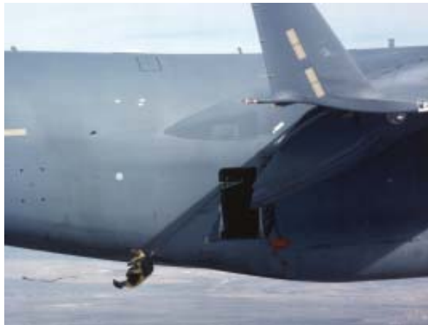
Dummy drop.