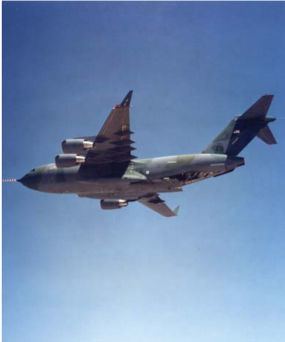
Cargo door opening in flight.