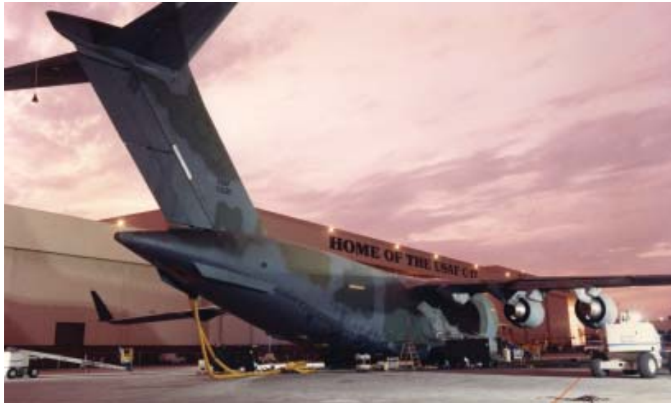
T-1 ground testing, 11 August 1991.