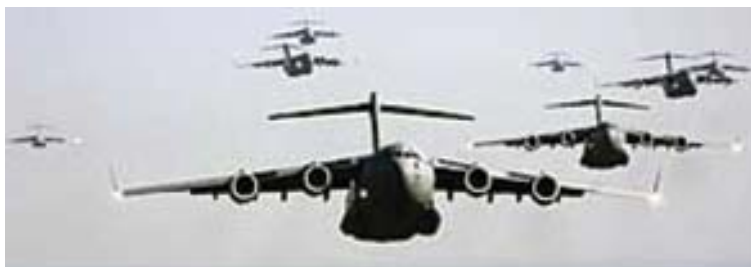
Nine-ship airdrop formation over North Field, South Carolina, January 2000.