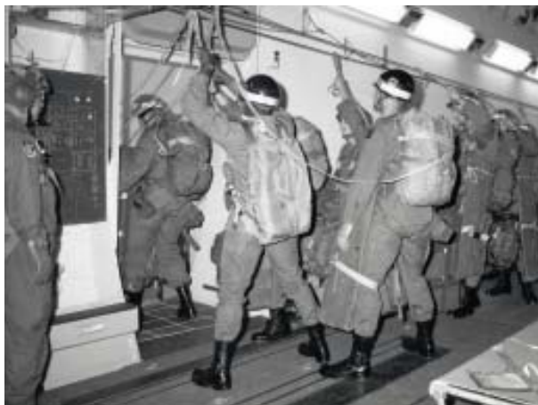
Practicing exiting procedures.