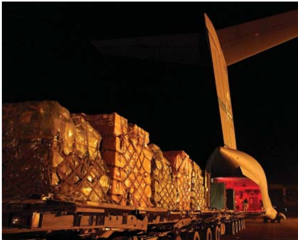
Unloading pallets of supplies from a C-17, Balad Air Base, Iraq, April 2004.