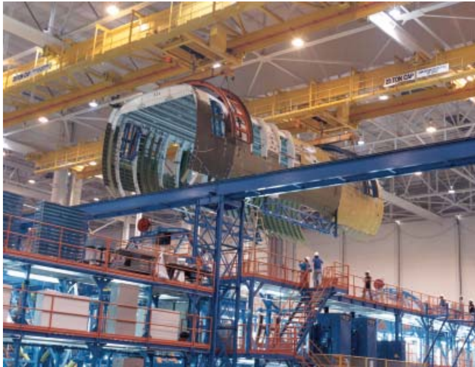
Center fuselage move.