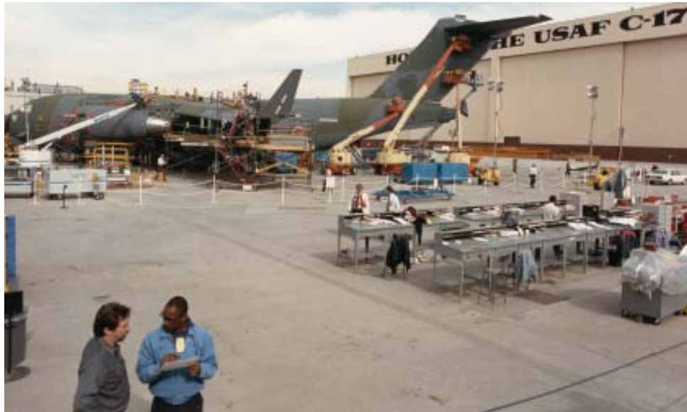
T-1 in pneumatic pit, January 1991.