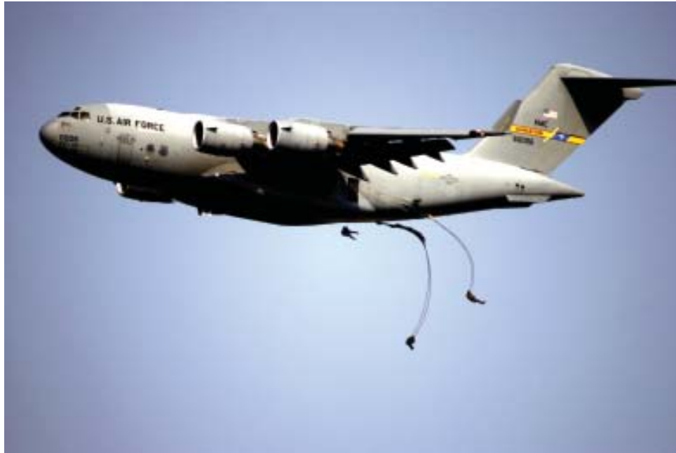
82d Airborne Division Rangers jumping from a C-17 over Fort Bragg, North Carolina, August 2001.