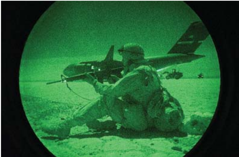
Navy Seabee providing perimeter security for a C-17, November 2001.