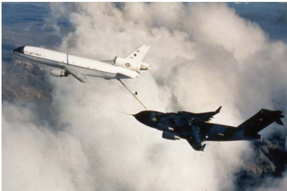
T-1 making its first KC-10 refueling, 23 September 1992.