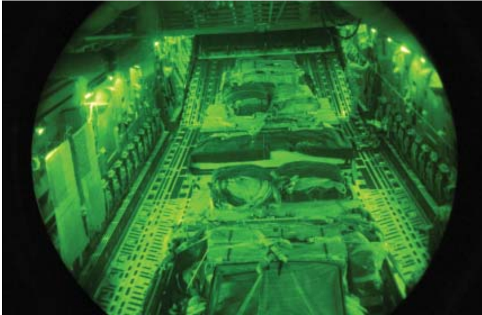
Performing the first C-17 combat heavy equipment airdrop, northern Iraq, 26 March 2003.