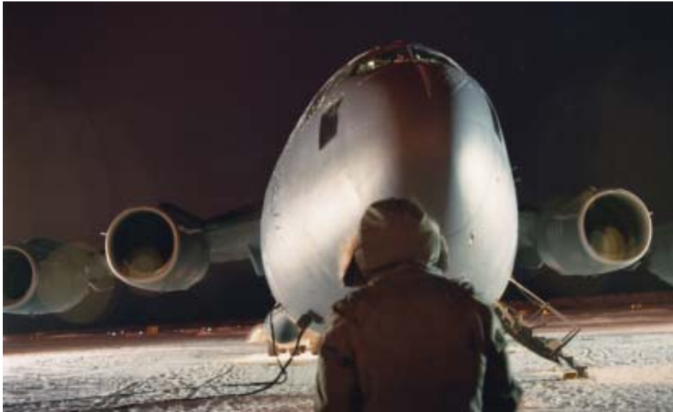
P-3 deployed to Alaska for cold-weather testing and completed its first flight over the North Pole on 10 February 1993. (Boeing)