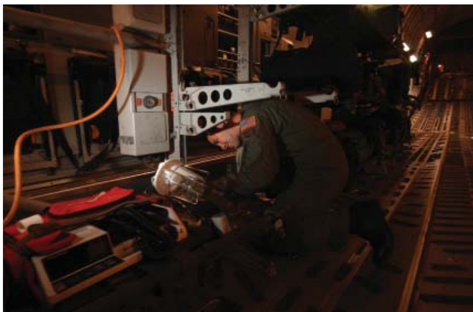
Securing stanchions on a C-17 for litter patients, Ramstein Air Base, Germany, October 2003.