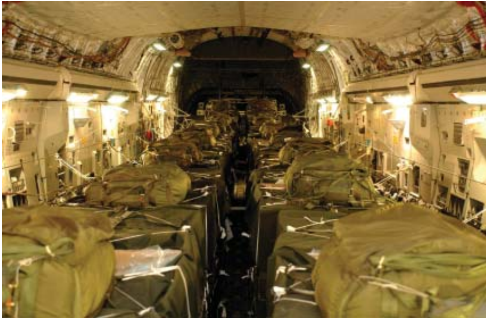
Bundles of wheat, blankets, and dates in the cargo bay of a C-17 on a high-altitude high-opening (HAHO) airdrop mission over northern Afghanistan, December 2001.