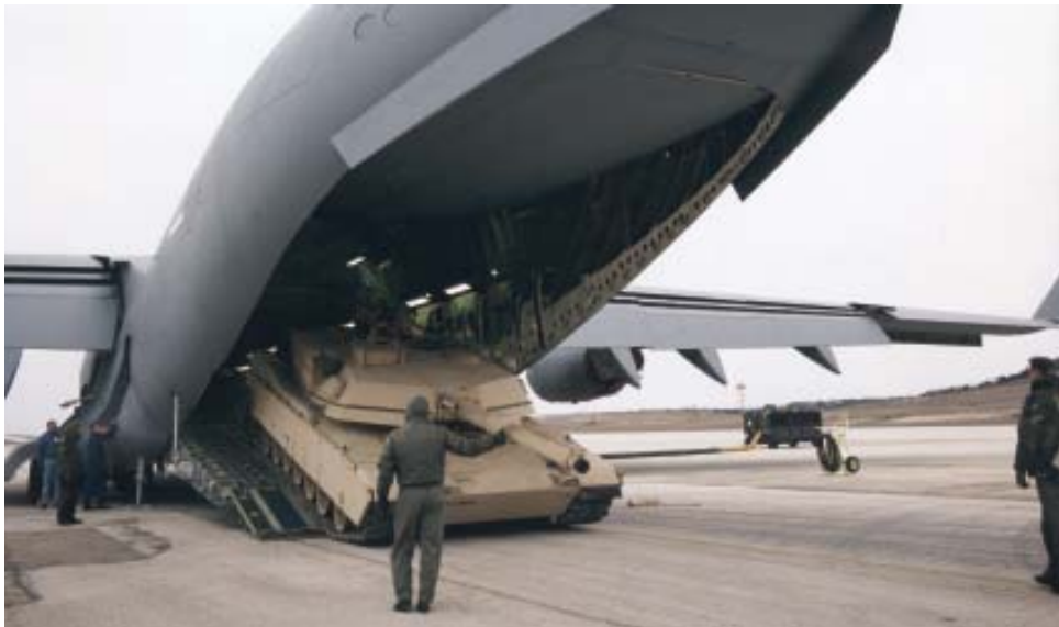
Loading the 130,000-pound M1A1 Abrams main battle tank, Fort Hood, Texas.