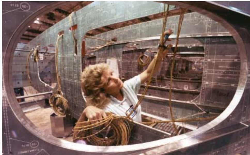
LTV worker installing wire routing.