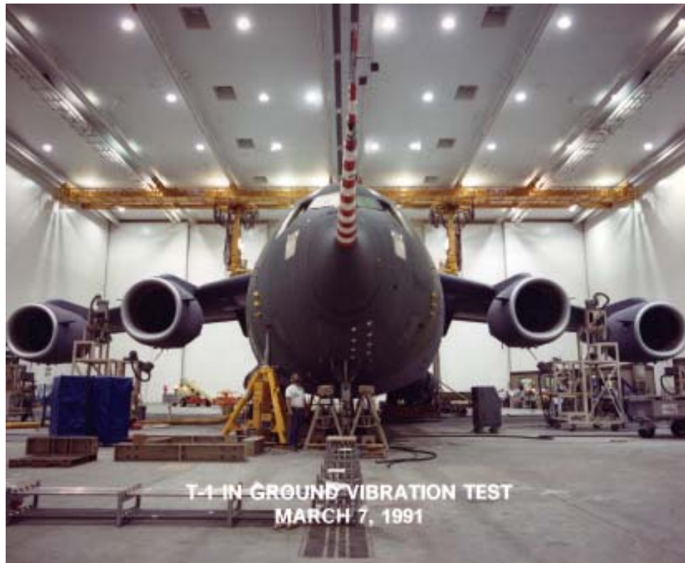
T-1 undergoing ground vibration test, March 1991.