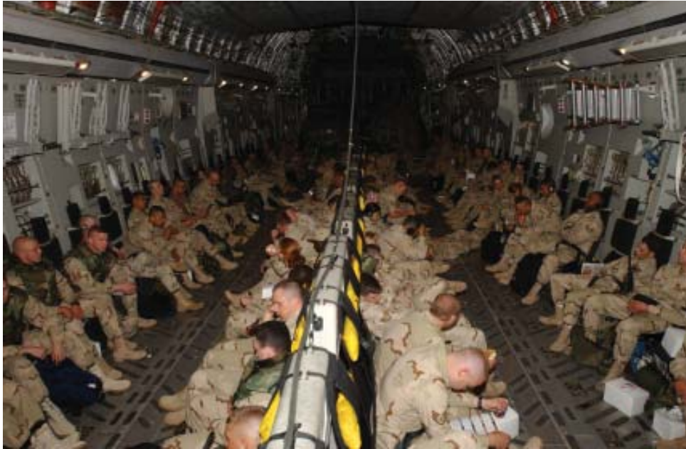
Troops aboard a C-17 flying to Southwest Asia, Iraqi Freedom, July 2003.