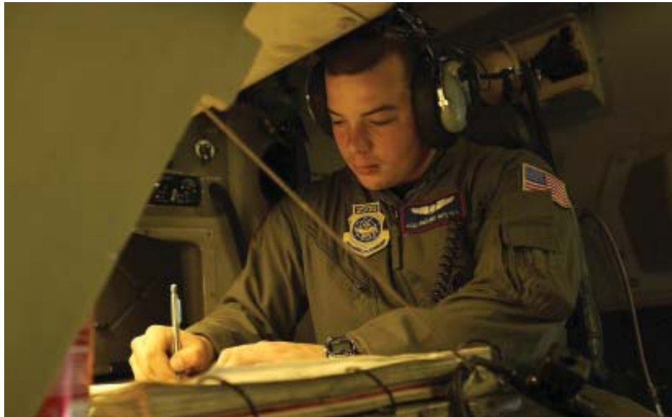
C-17 loadmaster at his station while en route to Port-au-Prince, Haiti, March 2004.