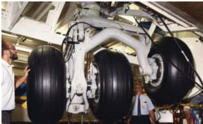
Main landing gear. (Boeing)