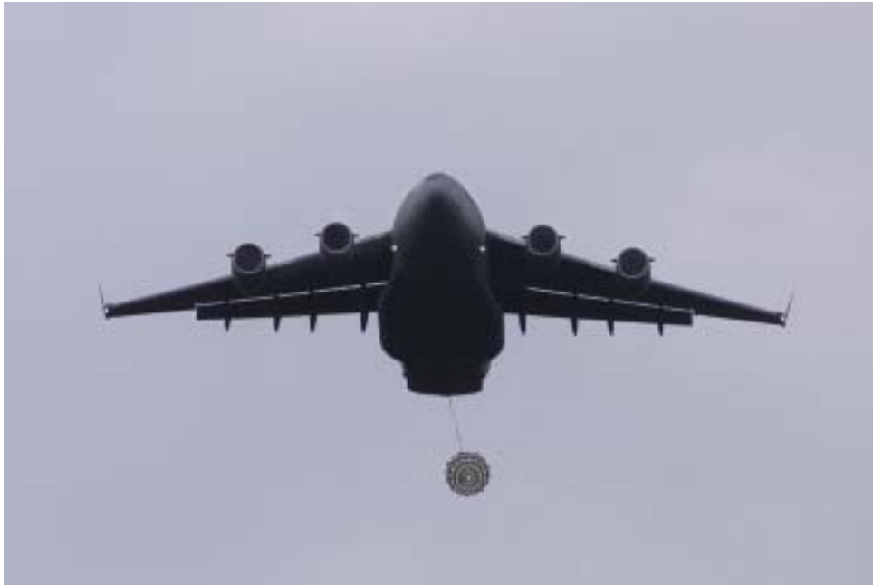
446th Airlift Wing crew conducting a heavy airdrop during Rodeo 2000.