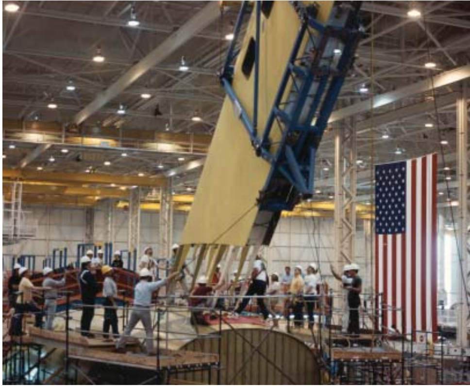
Vertical spars guided to aft fuselage, April 1990.