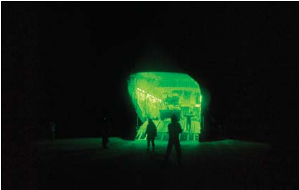
Airlanding cargo and equipment in northern Iraq, 28 March 2003.