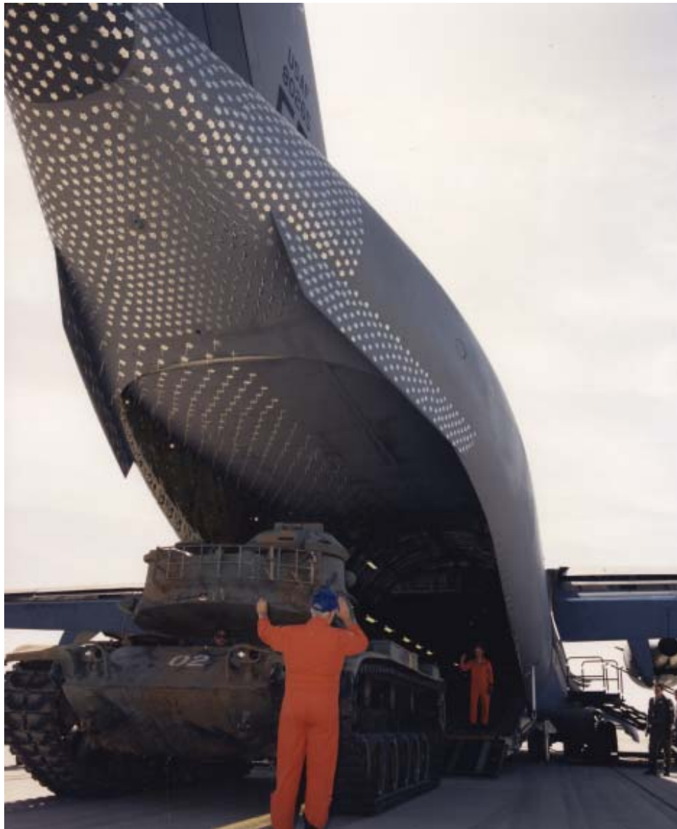
93,000-pound M-60 tank boards P-1. "Tufts" on rear fuselage record airflow patterns, Fall 1993.