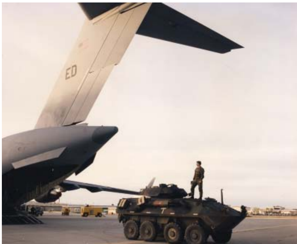
One of six Marine Corps light armored vehicles waiting to board P-4 for the range and payload demonstration flight of 30 January 1993. (Boeing)