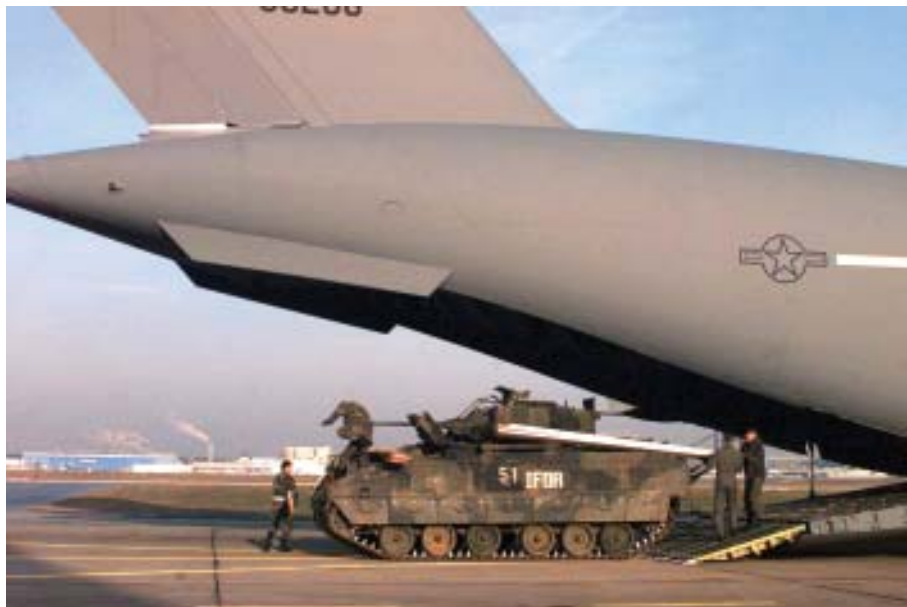
Loading a Bradley fighting vehicle during Joint Endeavor, January 1996.