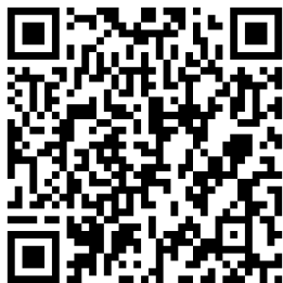
(Interactive Customer Evaluation -ICE)

Base Exchange (907) 753-4420 YMCA Military Lounge, Anchorage Airport (907) 248-2535 Shoppette (907) 753-1291 Global Credit Union (800) 525-9094 USO (907) 406-1264 TMO (907) 552-7202 SATO Travel (855) 732-8454