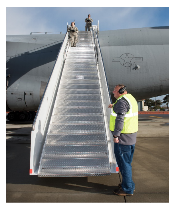
C-5 Stairs, Side View