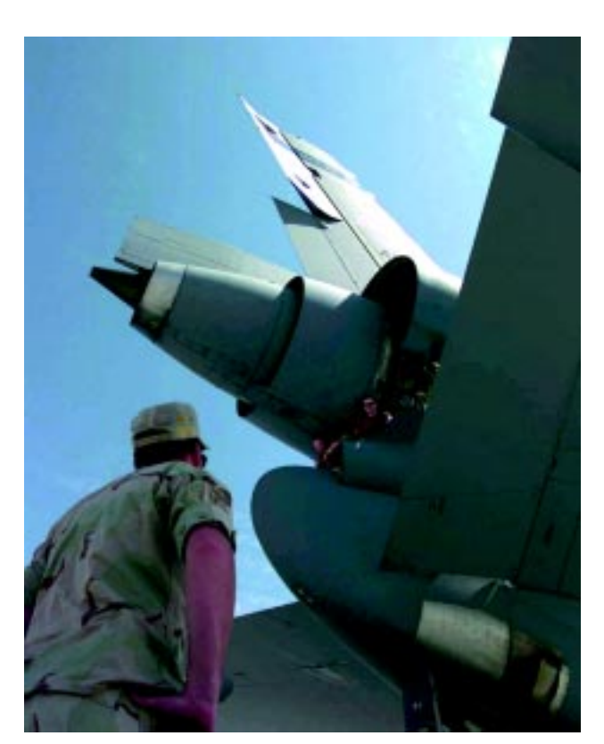
Maintenance personnel serviced a KC-10 in preparation for a refueling mission. During Phoenix Scorpion I, Extenders deployed to Europe and Diego Garcia as well as to Southwest Asia in preparation for conflict with Iraq.