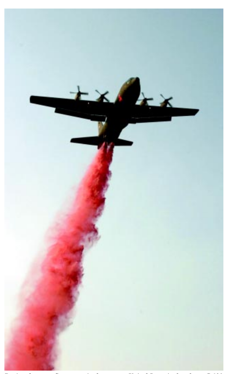
During the worst fire season in the western United States in decades, a C-130 dispersed fire retardant from the spouts of a modular airlift fire-fighting system (MAFFS). Fire suppression was a total force effort with the Guard and Reserve at the point of the spear: they possessed the MAFFS.

Demonstrators at the Vieques Naval Training Area on the Puerto Rican island of Vieques successfully blockaded the US Navy installation in order to prevent bombing training exercises. US marshals and Federal Bureau of Investigation agents flown in on AMC missions joined local law enforcement authorities in apprehending the protestors.<sup>139</sup>