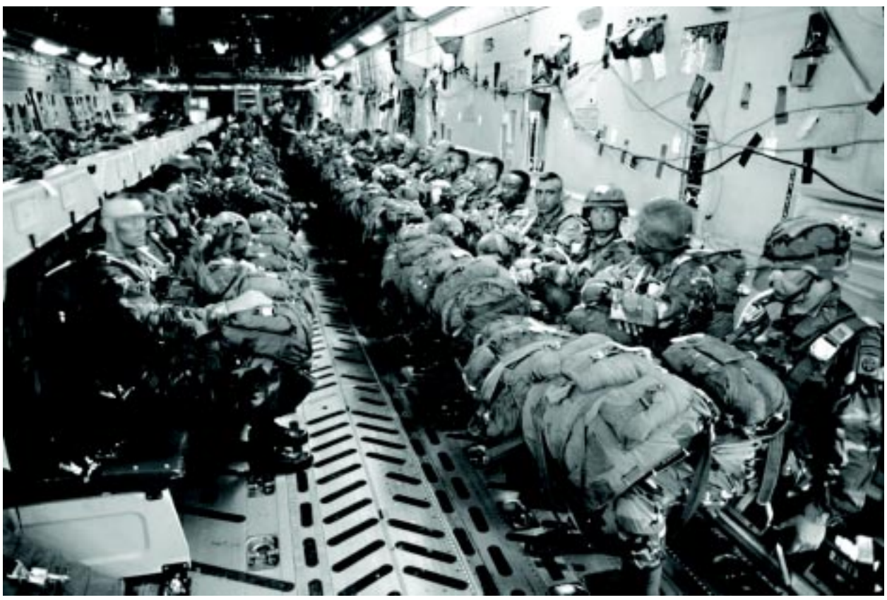
The C-17 was the platform for the airdrop in Exercise CENTRAZBAT 97. It could transport up to 102 paratroopers at a time.