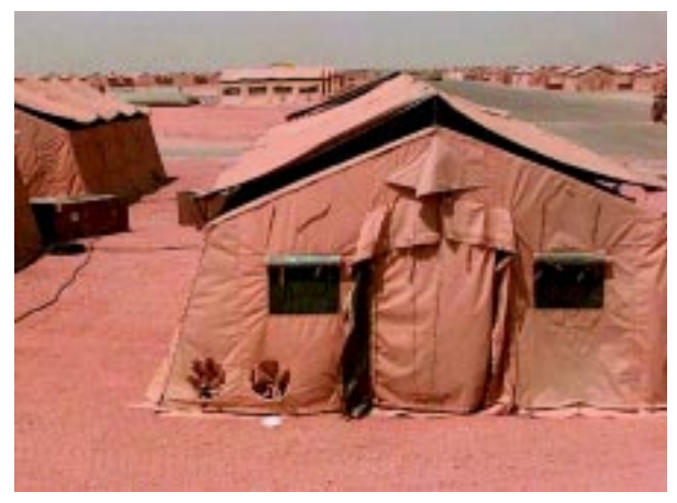
Reflecting on the conditions at Prince Sultan Air Base, Saudi Arabia, the tanker airlift control element commander reported that "When we arrived, nothing was here." A tent city quickly emerged to house tanker and other Air Force personnel as force protection concerns following the bombing of Khobar Towers led to the Desert Focus effort to consolidate military personnel at more secure locations.