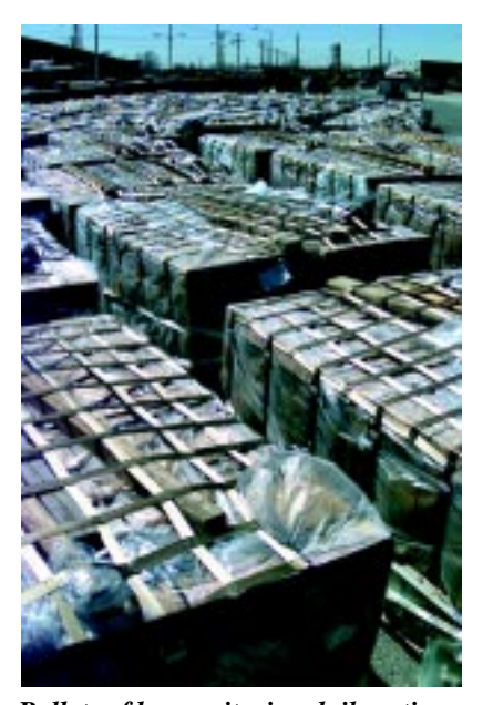
Pallets of humanitarian daily rations at Dover Air Force Base, Delaware, were destined for Kosovar Albanian refugees in Albania and the Former Yugoslav Republic of Macedonia during Operation Sustain Hope (Allied Harbour).