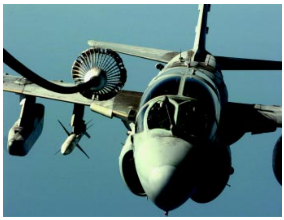
Configured for probe and drogue air refueling, a KC-10 Extender refueled a US Navy EA-6B Prowler over Southwest Asia during Operation Southern Watch. Because of the wide variety of aircraft with diverse refueling systems employed in Southwest Asia, the KC-10 was a coveted asset in the theater because it could be configured for boom as well as for probe and drogue refueling.