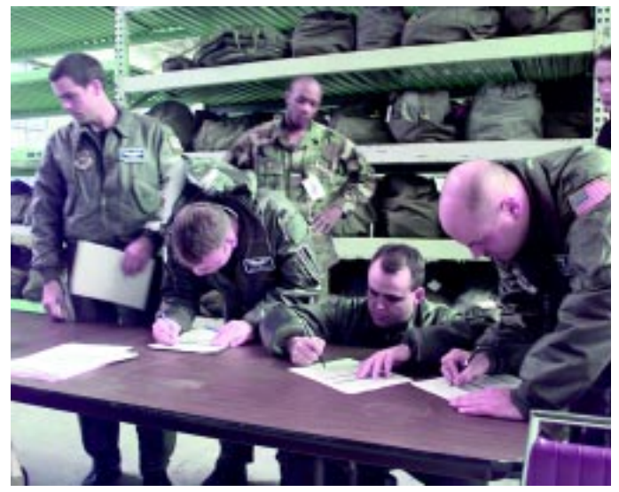
Aircrews at Grand Forks Air Force Base, North Dakota, filled out paperwork as they went through the mobility processing line for Operation Phoenix Scorpion IV.

Following release of a UN report documenting Iraq's subversion of the UN inspection program of Iraqi sites that could be used to illegally produce or store weapons of mass destruction, the National Command Authority authorized Operation Desert Fox ( Phoenix Scorpion IV ), a series of air strikes. President Bill Clinton terminated the operation on 19 December after some 90 targets had been successfully hit. Since most of the assets were already in place, the air mobility portion of the four-day campaign was relatively small. During the deployment phase of Desert Fox , AMC and its gained forces flew 62 airlift missions to transport 2,462 passengers and 1,940 short tons of cargo. Tankers flew 97 missions.<sup>123</sup>