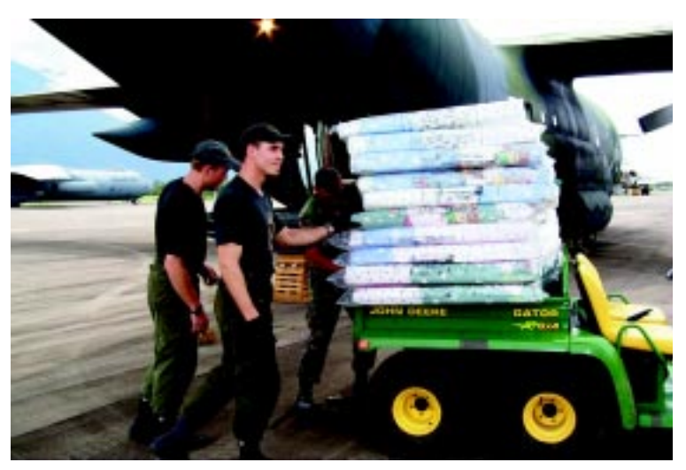
US and Canadian service members unloaded mattresses from an Air National Guard C-130 at La Cieba, Honduras, to aid refugees made homeless by Hurricane Mitch. The Guard and the Air Force Reserve Command took responsibility for most of the Denton Amendment relief cargo carried at no charge for private donor organizations.

Aerospace International, and the 89th Airlift Wing took delivery of it at Andrews Air Force Base, Maryland. Along with the C-32, the C-37A replaced the VC-137s used by high-ranking government officials.<sup>118</sup>