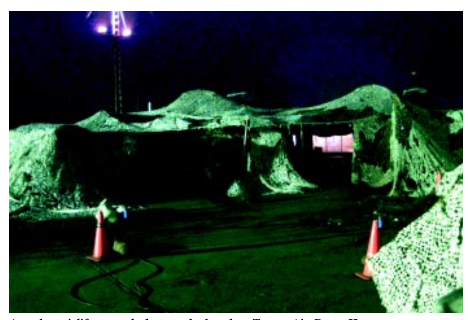
A tanker airlift control element deployed to Taszar Air Base, Hungary, to manage airfield operations for the Joint Endeavor airlift, for Taszar had become a major supply point for American ground forces bound for Bosnia. US airmen trained during the Cold War who deployed to the Hungarian fighter base could well reflect on how quickly a target had become a temporary home.

Most air mobility activity during the contingency was intratheater, with missions flying from Germany to downrange locations in the Balkans and Italy. In an unusual turn, strategic aircraft--C-141s and C-5s in addition to C-17s--flew missions within the theater. The integration of intertheater airlift missions from the United States to Germany with intratheater missions flown both by strategic aircraft and tactical C-130s was inefficient and ad hoc. As a consequence of Joint Endeavor , the Air Force honed doctrines and policies to better integrate strategic and tactical air mobility and defined new organizational structures in the theaters to plan, coordinate, and execute theater air mobility missions.<sup>79</sup>