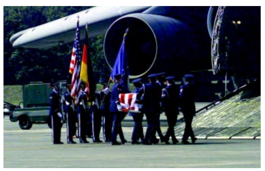
A C-5 carried the remains of victims of the terrorist bombing of the US Embassy in Nairobi, Kenya, to Dover Air Force Base, Delaware.