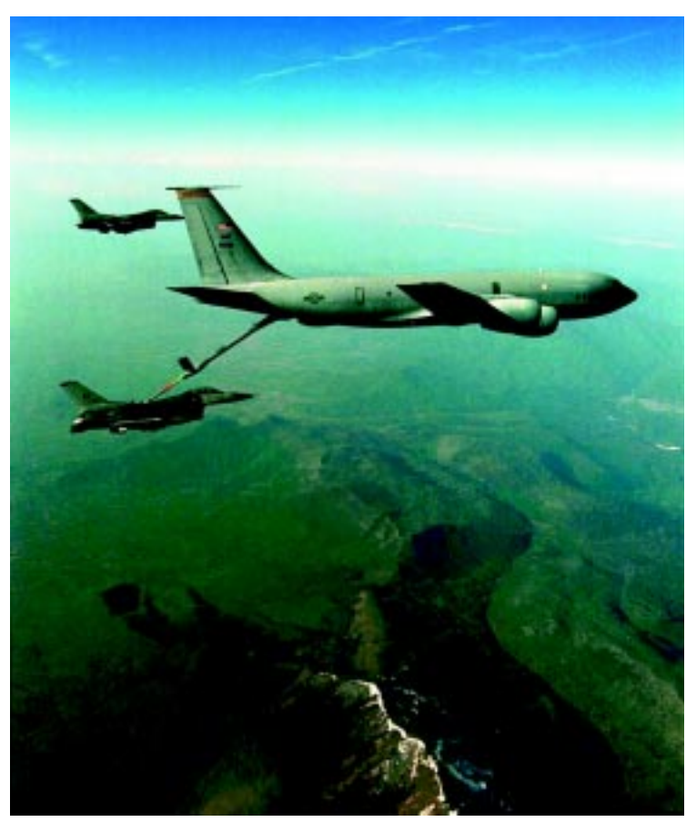
A KC-135 air refueled two US Air Force F-16 Falcons over northern Bosnia on a combat air patrol mission during Operation Allied Force. On occasion during the conflict, some tankers were in harm's way and had to change course due to the proximity of enemy aircraft.