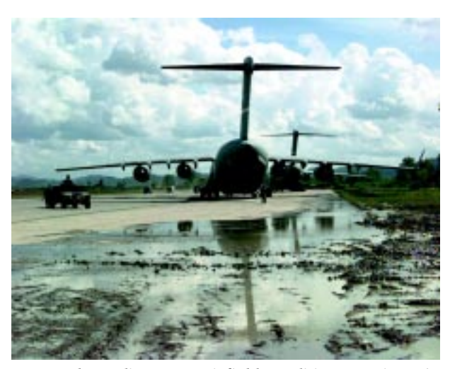
Due to the rudimentary airfield conditions at Tirana's Rinas Airport, the C-17 was the ideal candidate to deploy the large loads required by Task Force Hawk in Albania during Operation Allied Force. Apache helicopters and multiple launch rocket system components were among the cargo carried by the strategic airlifter.

One hundred fifty-nine USAF KC-10s and KC-135s deployed to Europe* to join the conflict. Overall, 175 US tankers in the theater contributed to the campaign. The air-refueling statistics were impressive. Tankers delivered 355.8 million pounds of fuel to 23,095 receivers. Airlifters from AMC and its gained units and contracted commercial flights flew 2,231 missions carrying 37,460 passengers and 59,055 short tons of cargo. AMC provided the director of mobility forces for the air campaign, deployed an air mobility element, and established tanker airlift control element and mission support team operations at 11 locations in the European area of responsibility, the TALCE at Tirana coming under the tactical control of USAFE. Primarily due to the large requirement for air refueling, a Presidential Selected Reserve Call-up for the first time in command history was necessary to mobilize members of the Reserve and the Guard. 130