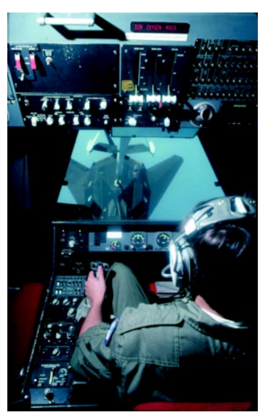
A boom operator aboard a KC-10 refueled a stealth fighter. The F-117 Nighthawk was among the aircraft AMC tankers refueled over the Atlantic during Phoenix Scorpion III and other deployments to Southwest Asia.