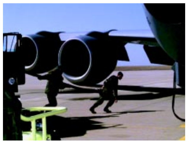
Noncommissioned officers deployed to Southwest Asia A deployed maintainer in Southwest Asia replaced aircraft for Operation Southern Watch fueled a KC-135 parts before a C-141 Starlifter departed on a Southern Stratotanker.