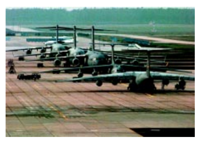
During Operation Joint Endeavor, C-17 Globemaster IIIs, the command's newest airlifter, shared ramp space at Rhein-Main Air Base, Germany, with C-141s, which ultimately would be replaced by the C-17. Rhein-Main became the European hub for strategic airlift aircraft, as the large aircraft joined C-130s in flying intratheater missions to the Balkans.

The strategic airflow in support of Operation Joint Endeavor began on 4 December 1995. The contingency was the multinational effort to insert a peacekeeping force into Bosnia to enforce the provisions of the Dayton Peace Accords by which the Muslims, Croats, and Serbs of Bosnia-Herzegovina and the government of the Federal Republic of Yugoslavia agreed to cease hostilities and honor the integrity of the Bosnian state. On 10 December, a C-17