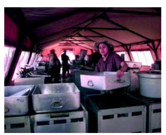
In Operation Phoenix Scorpion II, services personnel set up a field kitchen in Southwest Asia to feed 400 deployed personnel.