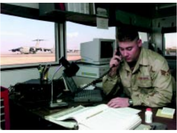
Tanker airlift control elements deployed to Southwest Asia during Operation Phoenix Scorpion II to facilitate airfield operations. At Thumrait Air Base, Oman, a TALCE member conferred with the crew of a departing C-5.