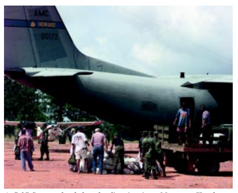
A C-27 Spartan landed at the dirt airstrip at Mocoron, Honduras, with relief supplies to aid refugees from Hurricane Mitch. From hub locations in Central America, it flew to outlying areas to deliver humanitarian cargo. Soon after participating in Hurricane Mitch relief operations, the C-27 was retired from the Air Force inventory.