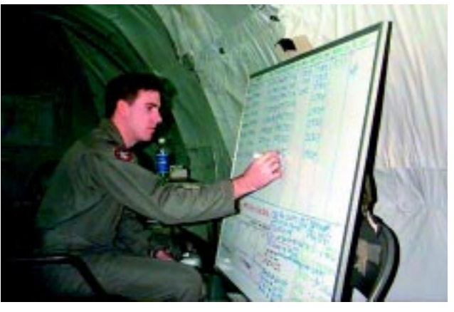
During Operation Phoenix Scorpion II, Hunter Army Airfield, Georgia, served as the stage base where aircraft could be serviced and aircrews changed. By updating the aircrew status board, the stage manager could determine which crewmembers were available to alert for flying duty.