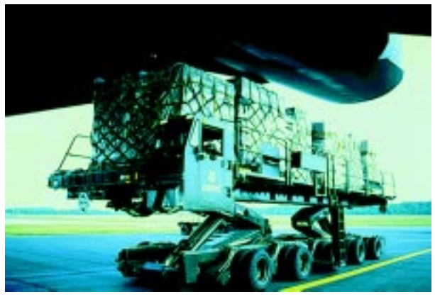
The Tunner 60,000-pound loader was the number two acquisition project in AMC. It could carry up to six cargo pallets at a time, loading and unloading cargo from military and commercial aircraft.

Ramstein Air Base, Germany, received the first delivery of the Tunner loader. Realizing that "hours lost on the tarmac . . . translate into lives lost," command leaders ensured that Tunners coming off the production line were immediately deployed in support of Operation Phoenix Scorpion II in February 1998. ^{103}