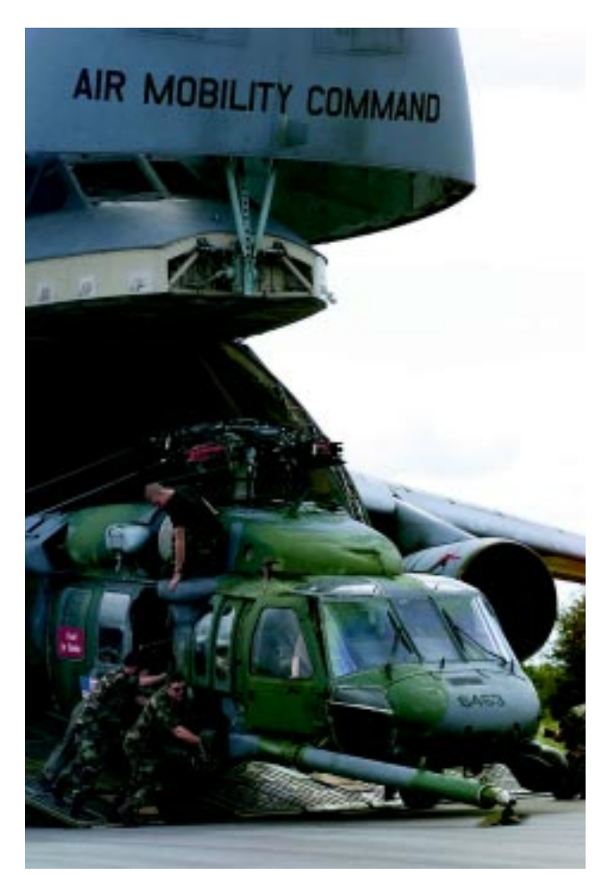
A C-5 delivered an Air Force MH-60 Pave Hawk helicopter in Mozambique for Operation Atlas Response. Through such deliveries, strategic airlifters facilitated intratheater flood relief.