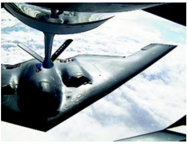
A KC-135 refueled a US Air Force B-2 Spirit over the Atlantic Ocean during Operation Allied Force. The first-ever combat missions of the stealth bomber were the product of a team effort with the tanker fleet.

As the Serbs drove the Kosovar Albanians into neighboring Albania and the Former Yugoslav Republic of Macedonia during Allied Force, a humanitarian disaster was in the making. To aid the refugees, Joint Task Force Shining Hope mobilized to provide food and shelter. A humanitarian airlift began to flow materiel into Albania on 3 April and, later, Macedonia in a relief effort that became Operation Sustain Hope. The task force became the US component of NATO Operation Allied Harbour. The task force was disestablished on 8 July 1999, while Allied Harbour concluded on 1 September. 126