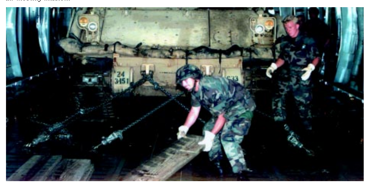
At Fort Stewart, Georgia, aerial port personnel along with infantrymen prepared a Bradley M2-A2 fighting vehicle for transport on a C-5 to Mogadishu, Somalia, in October 1993. With four air refuelings, the transport aircraft would fly non-stop to Africa to augment ground forces supporting Operation Restore Hope.