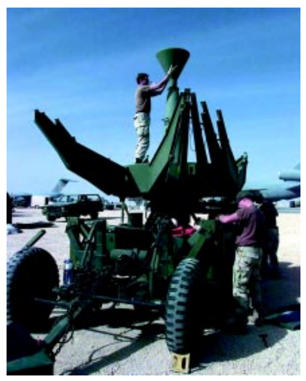
Installation of a quick reaction satellite antenna gave deployed forces in Southwest Asia direct commutations with planners in the United States during Operation Phoenix Scorpion II.