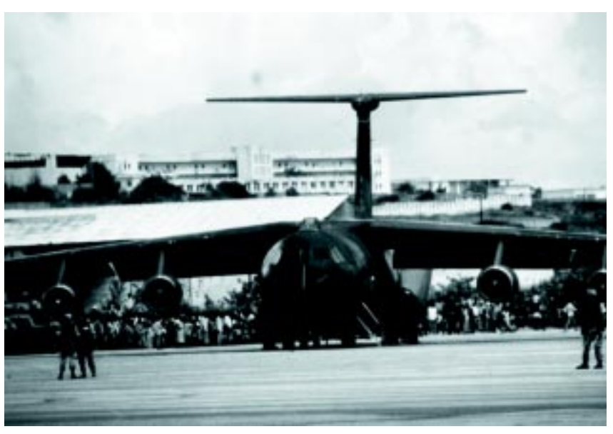
A C-141 arrived at Mogadishu International Airport, Somalia, on 9 December 1992, beginning the strategic airlift for Operation Restore Hope. Using a tanker airbridge to speed the flow of airlift aircraft to Africa, Restore Hope was the first major contingency to demonstrate the efficacy of merging air refueling and airlift assets under the Air Mobility Command.

The 97th Air Mobility Wing was activated at Altus Air Force Base, Oklahoma, as the command's first air mobility wing. The wing consolidated assets for C-5, C-141, and KC-135 aircrew training from the 443d Airlift Wing, the 340th Air Refueling Wing, and the 398th Operations Group. This action conformed to the Chief of Staff of the Air Force's single wing initiative to ensure "control of base activities through a single wing commander."