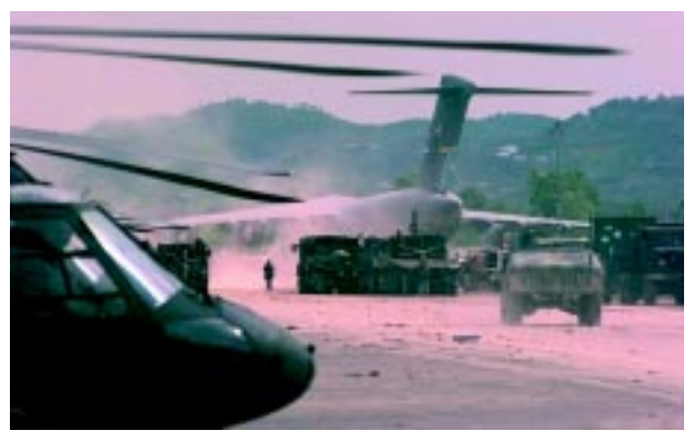
(Top) Air Force and US Army assets made for congestion on the flightline at Rinas Airport, Tirana, Albania, during Operation Allied Force. In this instance, the crowding was due to the convergence of the Task Force Hawk deployment, other Allied Force commitments, and the humanitarian relief effort directed by Joint Task Force Shining Hope, but congestion was often both the normal condition at contingency locations and a source of interservice friction.

(Left) Deployed force protection personnel moved a defensive fighting position along the flightline at Rinas Airport in Tirana, Albania, to protect Task Force Hawk and Joint Task Force Shining Hope during Operation Allied Force.