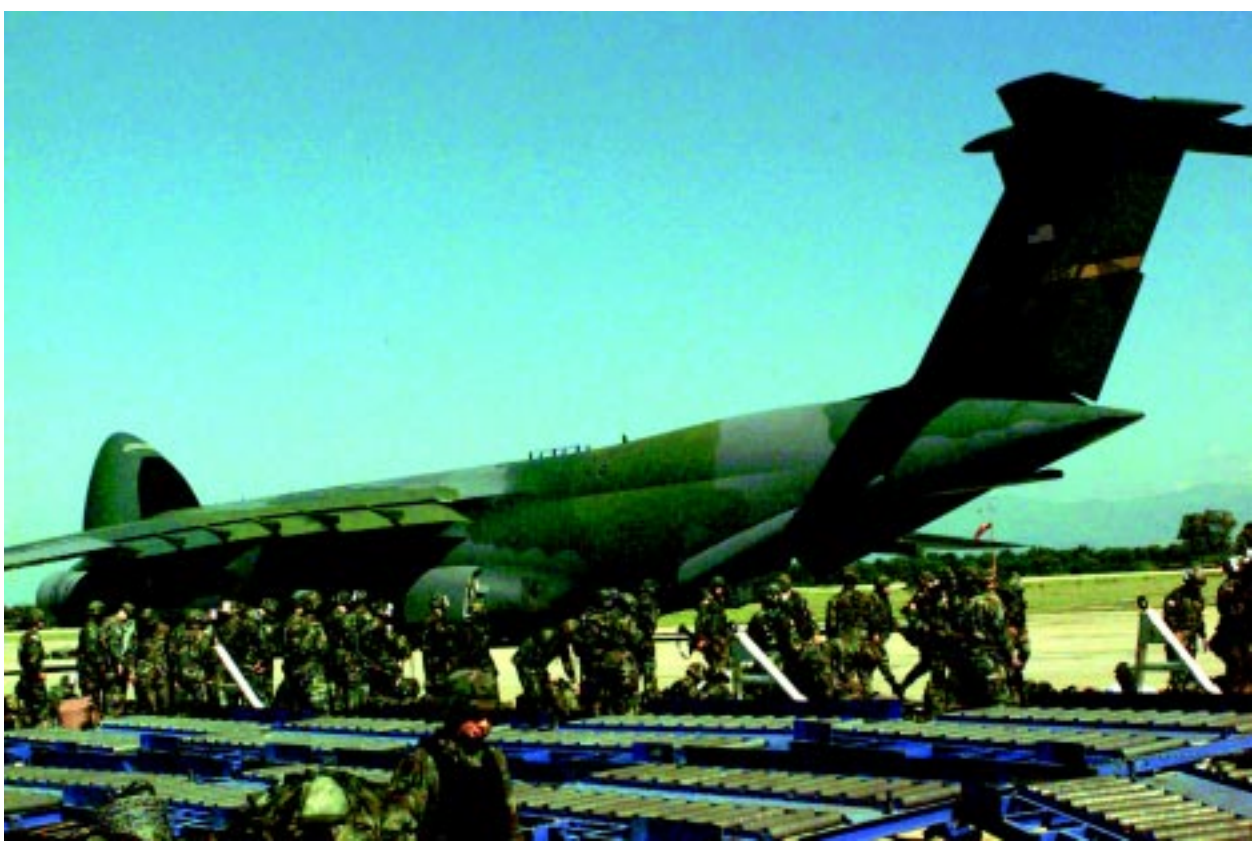
After arriving on a C-5 at Port-au-Prince, Haiti, soldiers from the 10th Mountain Division prepared to depart the airport during Operation Uphold Democracy.