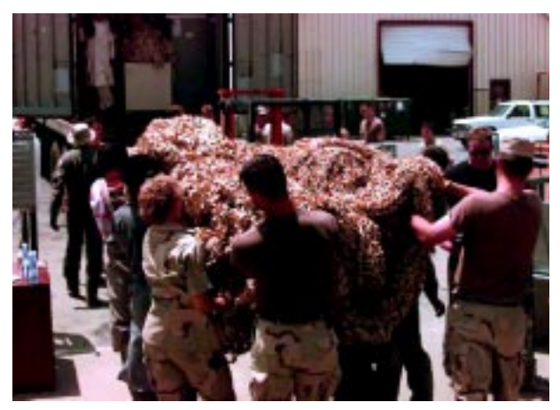
Following the terrorist attack on American forces in Dhahran, Saudi Arabia, at the Khobar Towers housing complex, KC-135 crews and support personnel joined in to move tanker operations from Riyadh to Prince Sultan Air Base. The relocation was part of the Desert Focus operation to move US military personnel to more secure surroundings.