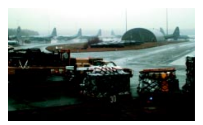
Ramstein Air Base, Germany, became the focal point for C-130s during Operation Joint Endeavor. The poor weather conditions experienced at Ramstein and other locations in Central and Southeastern Europe frequently forced flight delays during the contingency.