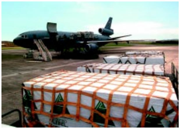
(Top) A KC-10 unloaded lumber at Naval Air Station Roosevelt Roads, Puerto Rico, in the aftermath of Hurricane Georges. Designed as an advanced tankercargo aircraft, the cargo role of the KC-10 became more pronounced after AMC was activated.