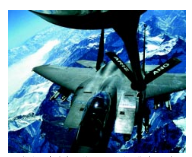
A KC-135 refueled an Air Force F-15E Strike Eagle on patrol during Operation Northern Watch. In 1999, during Operation Allied Force, the requirement for air refueling support worldwide was so large that a Presidential Selected Reserve Call-up of tanker assets was necessary to support the Northern Watch mission over Iraq.

Other lead command responsibilities included management of the processes to identify requirements, development of baseline inspection and evaluation standards, and formulation of baseline training events and employment tactics. AMC would develop air mobility curricula to meet the training needs of all commands, establish logistics program standards, and in coordination with other commands establish command and control processes. It was the advocate for air mobility, planning for system-wide unique equipment as well as addressing personnel issues.<sup>92</sup>