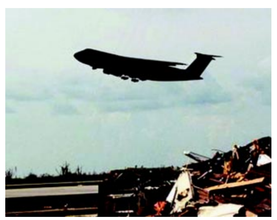
Although Homestead Air Force Base, Florida, had been devastated by Hurricane Andrew, it became the hub for the airborne relief effort. C-5 Galaxies frequently used the base to deliver cargo and personnel to help the Southeast recover from the effects of the most costly hurricane in American history.