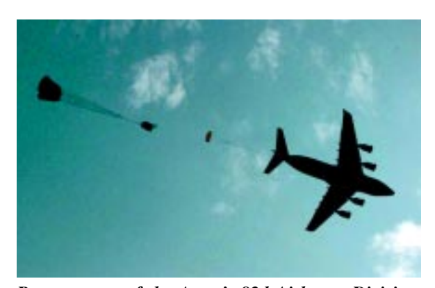
Paratroopers of the Army's 82d Airborne Division along with other soldiers from Kazakhstan, Kyrgzstan, and Uzbekistan practiced jumping from C-17s at Fort Bragg, North Carolina, in preparation for Exercise CENTRAZBAT 97, the longest airdrop in history.