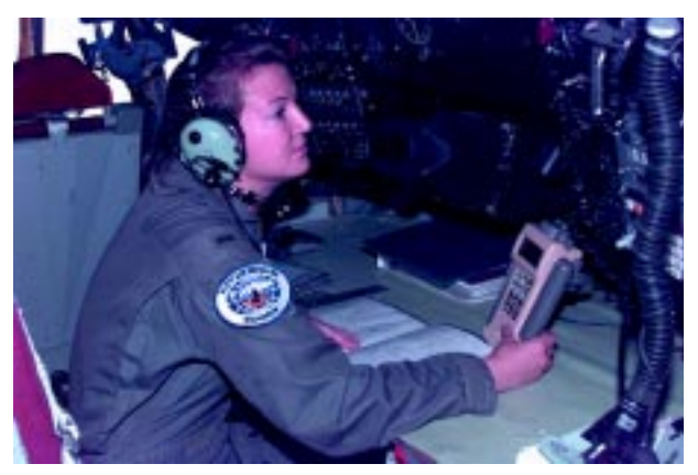
(Top) For close to half a century, the navigator had been an integral member of the KC-135 crew of four, but technological advancements in the cockpit would lead to the elimination of the position in the early 21st century.

The first production-modified KC-135 Pacer CRAG (Compass, Radar, and Global Positioning System) aircraft (tail number 57-1435) arrived at the 22d Air Refueling Wing, McConnell Air Force Base, Kansas. Pacer CRAG upgraded navigational avionics, replaced compass and radar systems with commercial off-the-shelf systems, and added a second inertial navigation system (INS) plus a Navstar global positioning system (GPS) receiver. The upgrade would eliminate the aircrew navigator. 110