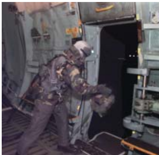
C-5 Troop Door in Jump Platform Configuration

A C-5 aircrew from Dover Air Force Base, Delaware, established an uncertified record for the heaviest airdrop ever accomplished from a single aircraft. The Galaxy airdropped on the first pass over the Army's Fort Bragg, North Carolina, drop zone four Sheridan tanks and 73 combat-equipped paratroopers on the second pass for a total of 177,000 pounds. The paratroopers and their equipment were assigned to the 82d Airborne Division's XVIII Corps based at Fort Bragg. 205