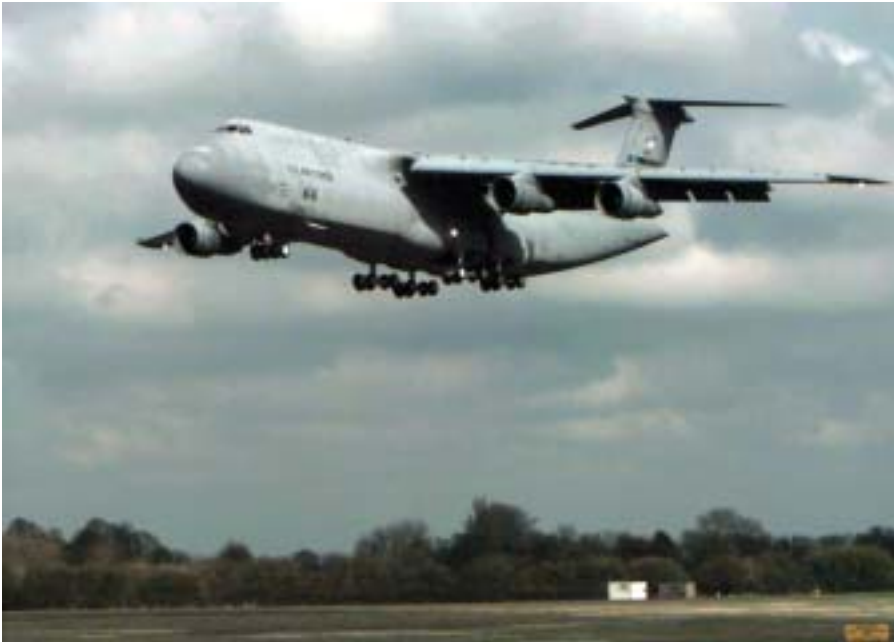
C-5 Prepares to Land

technology relatively unfamiliar to American engineers. After a month-long orientation from Russian scientists, government and university scientists tested the reactors at the Phillips Laboratory to discover how the Topaz II technology might be adapted to American nuclear reactors. 253