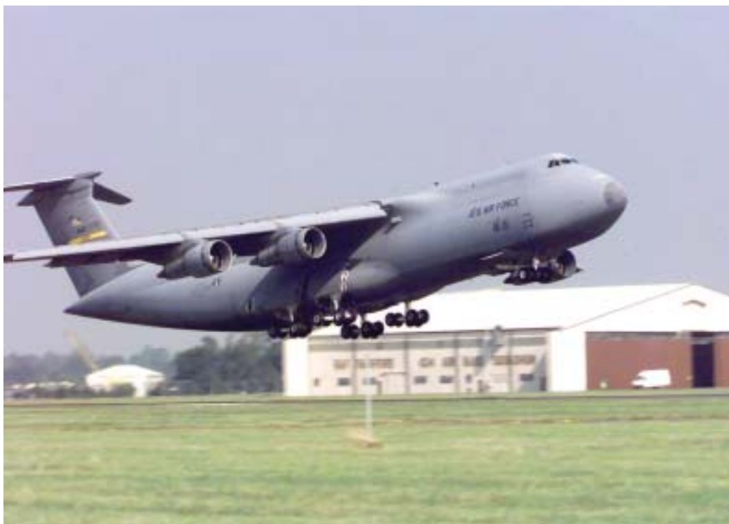
C-5 at Lift-Off

humanitarian cargo to needy people over great distances. Thus, the “Candy Bomber’s” words carried weight when he described the C-5’s presence at Tempelhof as one of the city’s “most significant events since the Berlin Airlift.” 51