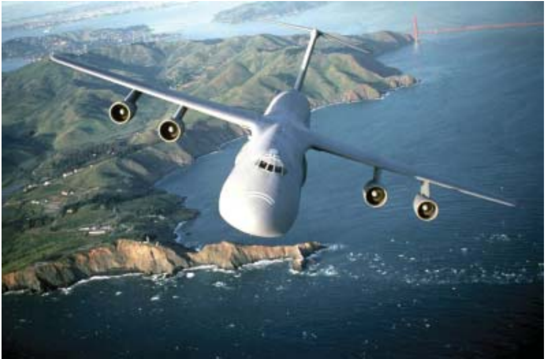
C-5 with Gray Paint Scheme against Backdrop of San Francisco's Golden Gate Bridge