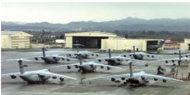
C-5s Lined Up at Travis Air Force Base, California

23-25 May 94 Headquarters Fifteenth Air Force hosted an AMC-wide conference for C-5 loadmasters at Travis Air Force Base, California. Nearly a decade had passed since experienced C-5 loadmasters had met to discuss common issues and concerns. Attending the conference were loadmasters from AMC's two C-5 wings as well as loadmasters from Headquarters AMC and the command's two numbered air forces. One of the most important issues addressed was the importance of acquiring a new heavy-duty winch for the C-5, since the Galaxy's current winch was the same one used by the C-133 Cargomaster, the USAF aircraft responsible for transporting outsize cargo before the C-5 became operational. 268