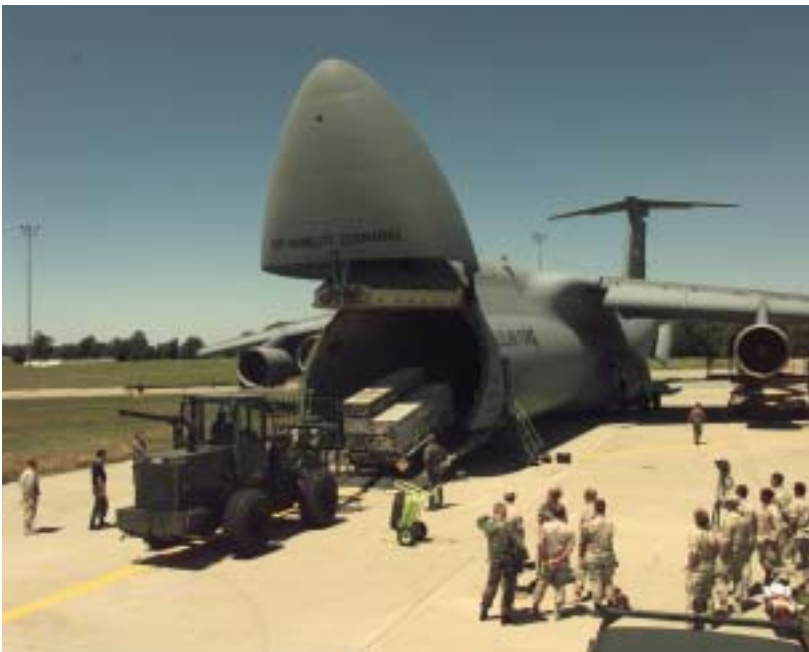
C-5 Front-End Loading

A C-5A assigned to the 60th Military Airlift Wing at Travis Air Force Base, California, airlifted a ship reduction gear weighing 88 short tons from Norton Air Force Base, California, to Brunswick Naval Air Station, Maine, setting a new record for the heaviest single item ever airlifted. The previous record was established on 21 February 1978, when another Travis C-5A transported a ship reduction gear weighing 64 short tons. 105