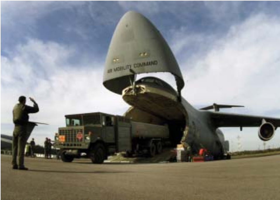
Fuel Truck Coming Off a C-5

Forces Treaty. The last GLCM components were airlifted from Sicily in March 1991. 234