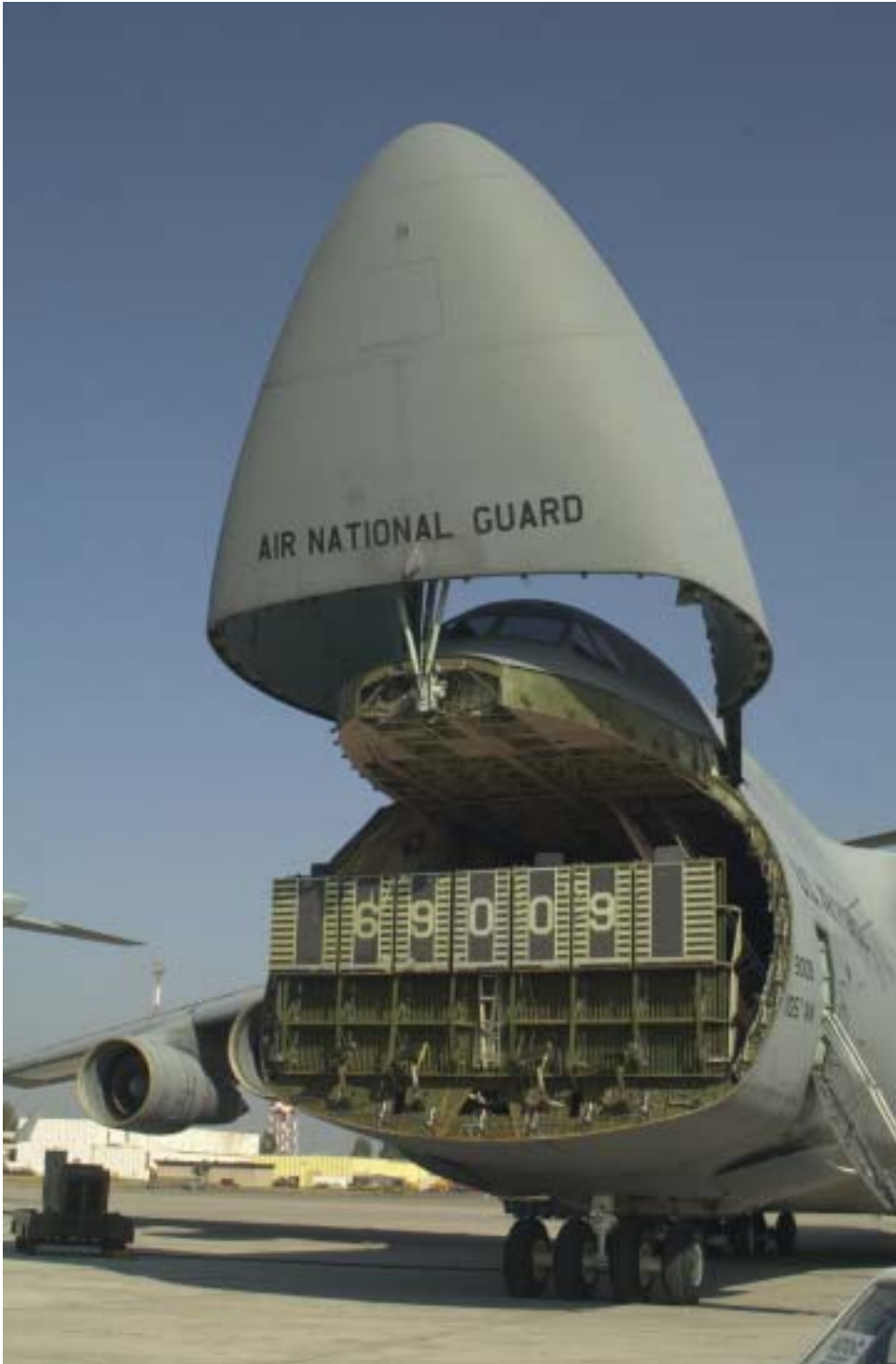
Loading Cargo in Visor-Up Mode