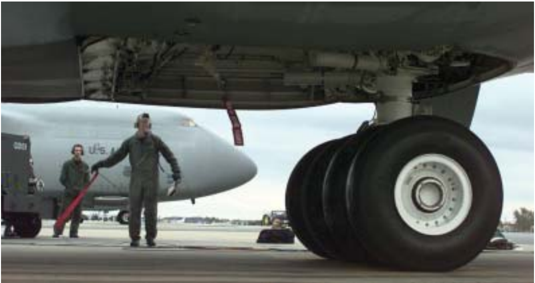
C-5 Nose Landing Gear Block-In

C-5A number 69-0016 was equipped with the modified C-5A wing and the European I camouflage paint scheme. It displayed the nickname City of San Antonio and markings that identified it as an aircraft belonging to the Air Force Reserve and the 433d Tactical Airlift Wing. 164