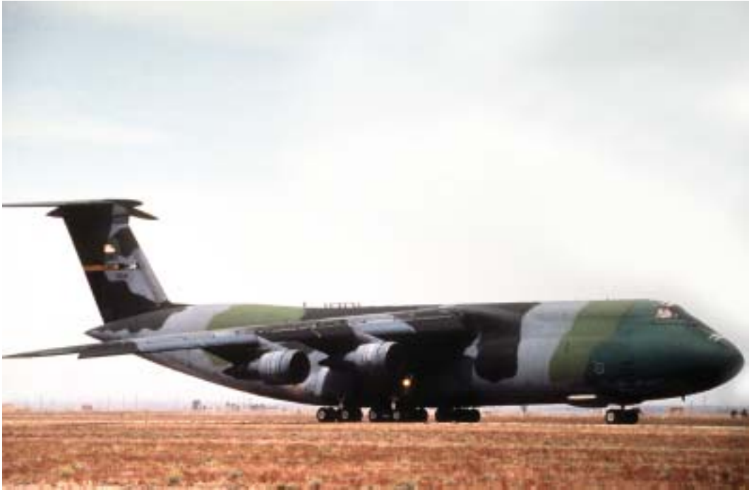
C-5 in European I Paint Scheme Taxis In

States to Dover. Because some of the bridge parts were too large to be handled by a standard forklift offloader, the first C-5 mission picked up a special tactical offloader at Rhein-Main Air Base, West Germany, en route to Islamabad. 225