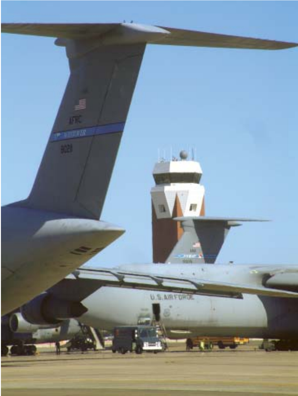
One of the C-5s assigned to Westover Air Reserve Base, Massachusetts, lumbers out of its parking spot about to embark on another delivery of supplies and troops for Operation IRAQI FREEDOM. In the background, there is a C-5 from Stewart Air National Guard Base, New York, and Westover's new control tower. March 2003.