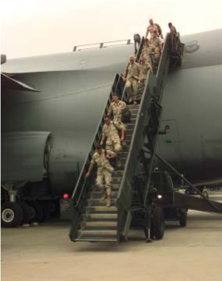
Soldiers Descend from C-5 Troop Compartment