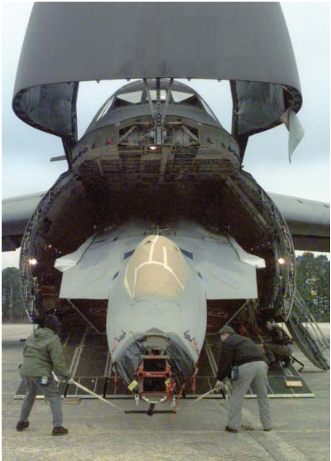
Forward Fuselage of an F-22 Fighter Aircraft Being Unloaded