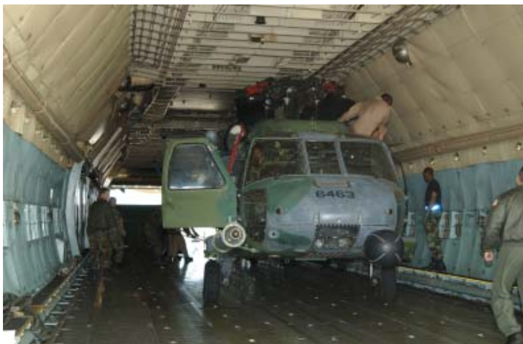
Helicopter Being Positioned on a C-5

flights. From the first Afghan humanitarian mission on 4 March 1986 until the last such mission was completed in mid-1993, C-5s and C-141s--belonging first to the Military Airlift Command and then to the Air Mobility Command--made 115 flights to Chaklala Air Base. C-5s flew about 45 percent of the missions. During the program's 8 years of operation, approximately 900 Afghan patients received pro bono medical treatment, about half of them in American hospitals. 180