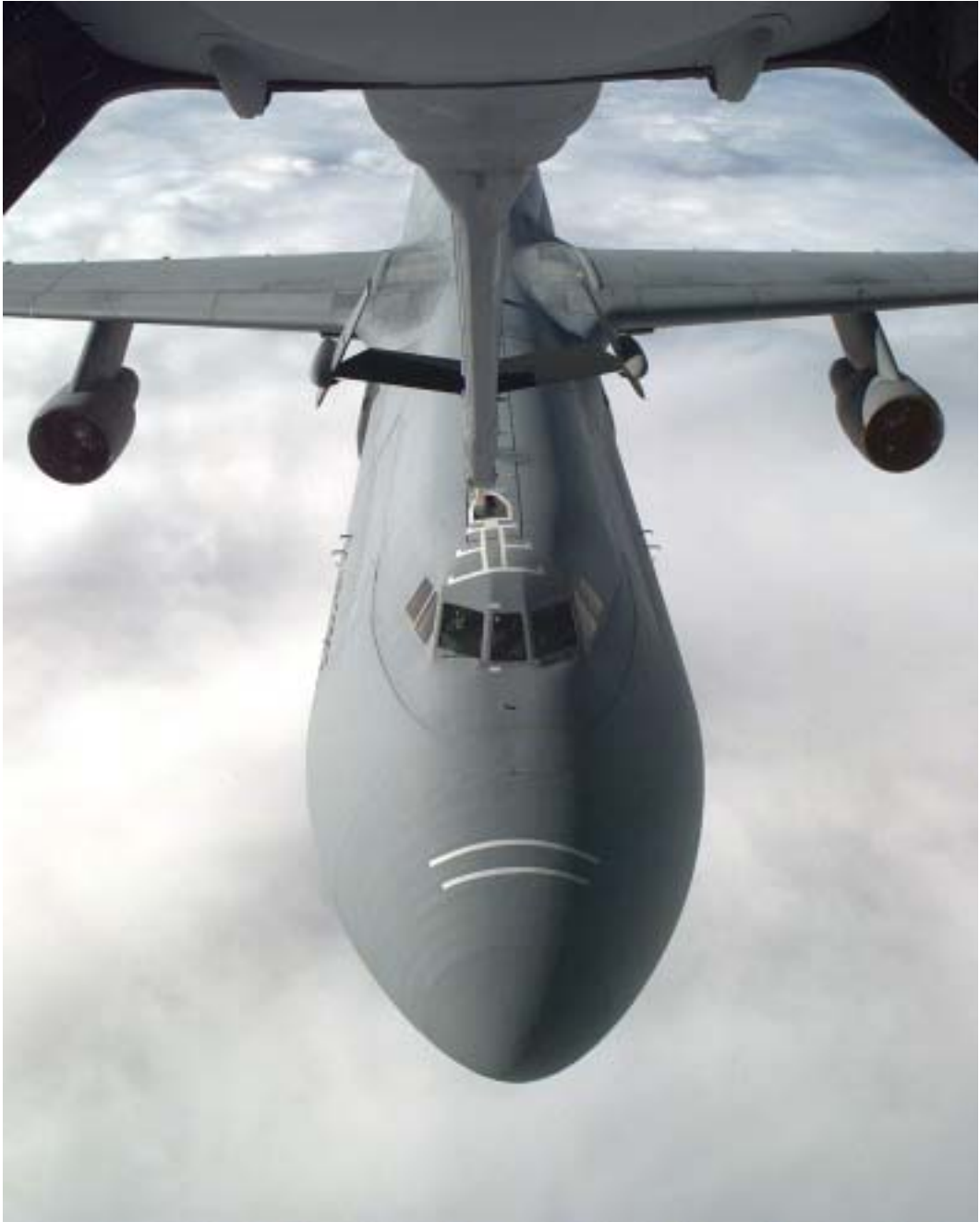
C-5 Being Air Refueled

C-17. Air Force officials continued to believe that a mix of airlift capabilities attainable with the operation of several types of generic aircraft would best satisfy America's future military