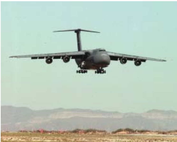
C-5 on Final Approach