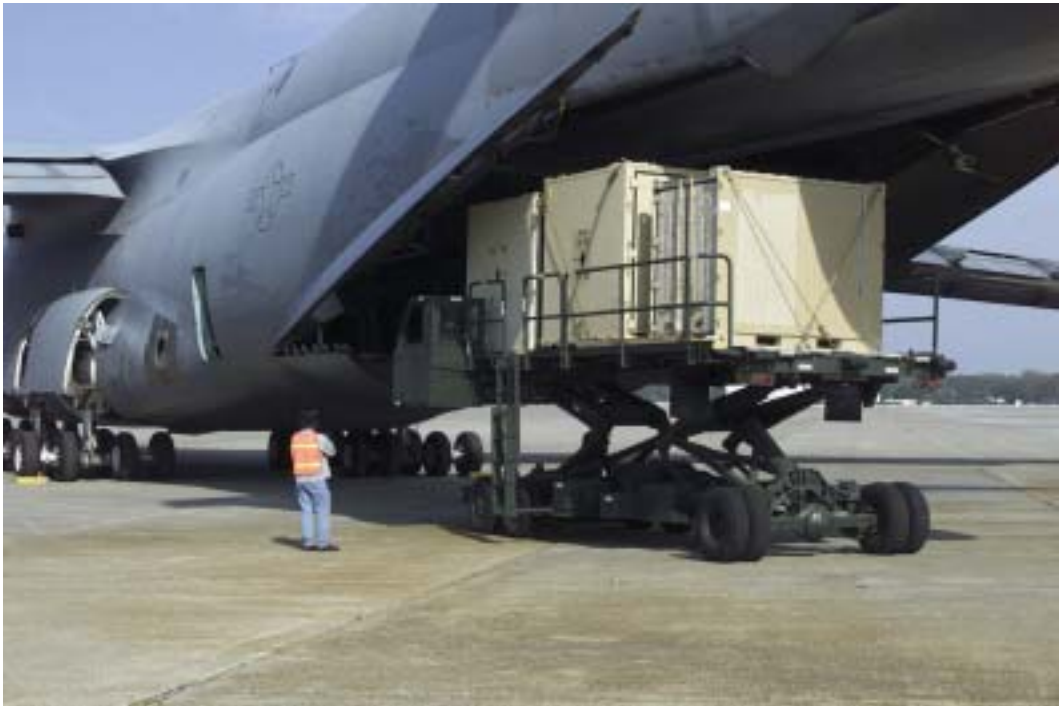
60K Loader Moves Cargo Onto a C-5

of MAC's 77 C-5As received new center wings, two new inner wing boxes, and two new outer wing box sections. The improved, modified wings and their components were made of super-strong aluminum alloys, which had simply had not been available when the C-5s' original wings were produced in the late 1960s and early 1970s. Although the increased thickness of the modified wing added approximately 18,000 pounds to the aircraft, the extra weight equated to less than five percent of a C-5A's empty operating weight. 134