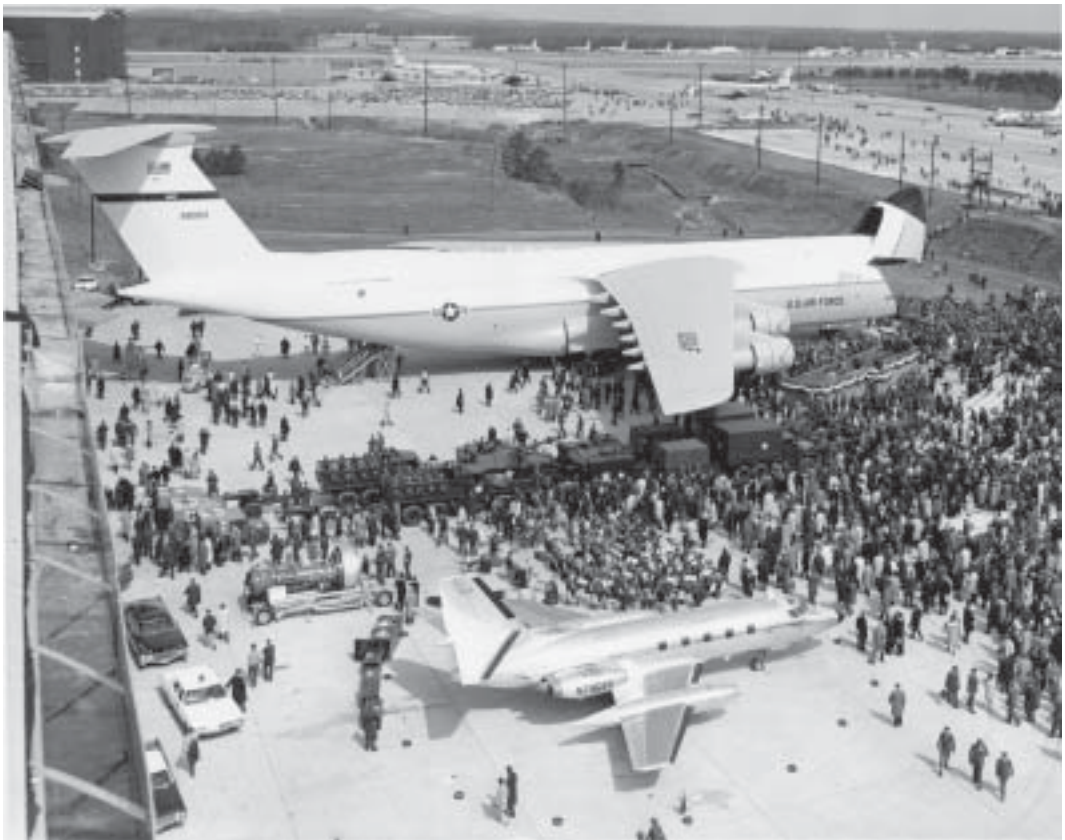
C-5A Rollout Ceremony, 2 March 1968

President Lyndon B. Johnson attended the rollout and christening ceremony of the first C-5A (tail number 66-8303) at the Lockheed-Georgia Company. Speaking under clear, blue skies to about 10,000 people, President Johnson quoted President Franklin Roosevelt when reminding the audience that the C-5A symbolized the fact that “great power involves great responsibility.” The commander in chief explained how significantly the C-5A would increase America’s military airlift capability. “Today it takes 88 cargo planes to move an infantry brigade from Hawaii to Vietnam. Their heaviest equipment would have to go by sea. That entire operation could be handled by 20 of these aircraft,” Johnson said. 32