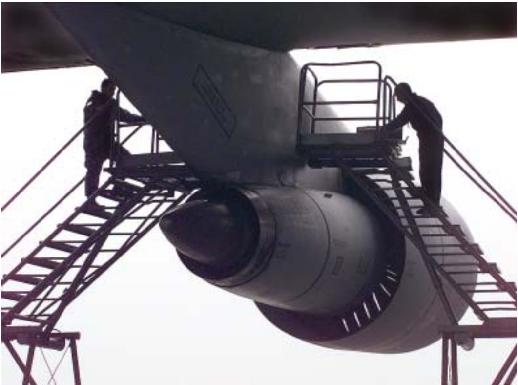
C-5's General Electric TF39 Turbo Fan Engine

The Lockheed Aircraft Corporation submitted an unsolicited proposal requesting new tests on the capabilities of the C-5A/B. The proposal rekindled the controversy over whether the C-5A/B or the McDonnell Douglas C-17 offered the best means for correcting airlift shortfalls, at the best price and earliest date. 153