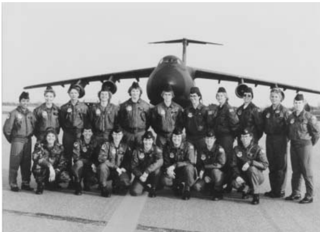
All-Female C-5 Crew from Dover Air Force Base, Delaware

to Charleston Air Force Base, South Carolina; RAF Mildenhall, United Kingdom; Incirlik Air Base, Turkey; and Rhein-Main Air Base, Germany. 199