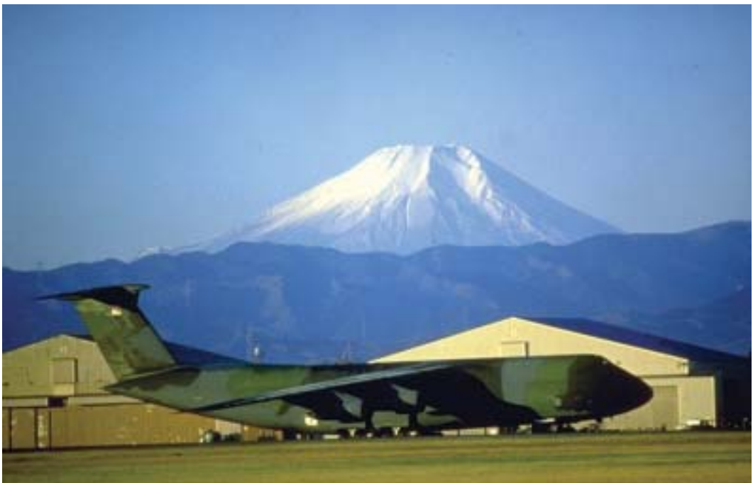
C-5 at Yokota Air Base, Japan, with Mount Fuji in Background