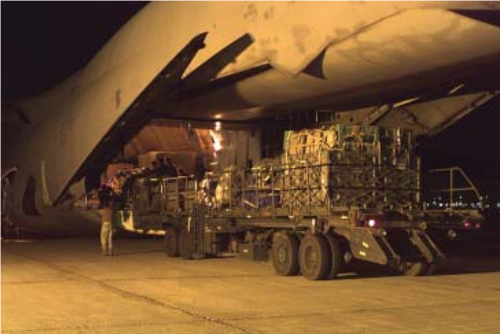
C-5 Is Loaded at Night

aircraft had “sufficient flying capability to meet contingency plans.” The wing modification process performed by the Lockheed-Georgia Company took approximately eight months per aircraft. Since January 1982 when the modifications began, the slowness of the process had required MAC to operate for much of the time with a maximum of 58 C-5As. 172