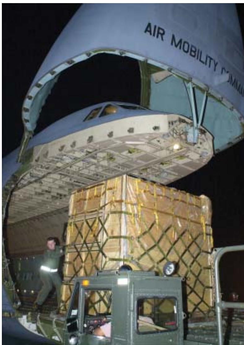
C-5 Receives Cargo at Night

the deployment phase, each available C-5 averaged a delay of nine hours for logistical reasons. The C-5 utilization rate 237 averaged only 5.7 hours daily rather than the advertised, expected surge rate of 11 hours for wartime operations and 9 hours for sustained operations. For the entire operation, only 67 percent of the C-5 fleet was available daily for operational missions, while on some days, only 50 percent of the fleet was ready to fly. Thus, at various times during Operation DESERT SHIELD/DESERT STORM, poor reliability prevented the C-5 from fulfilling all of its outsize airlift requirements. 238