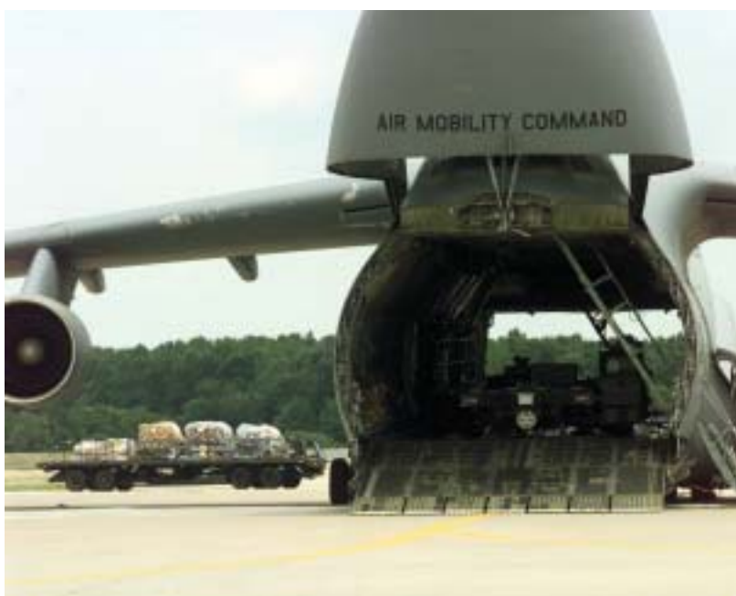
C-5 in Drive-On Mode

From the arrival of the first NICKEL GRASS mission on 14 October through the operation's last mission flown on 14 November 1973, a combined force of C-5As and C-141s airlifted 22,318 short tons of equipment and supplies to Lod International Airport. The airlift consisted of 567 airlift missions, which required 18,414 hours of flying time. The 145 missions flown by C-5As airlifted nearly half the total tonnage. 65